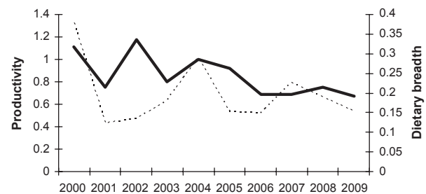
Figure 3. Variations in productivity (continuous line) and dietary breadth (standardized food niche breadth, dashed line) during 2000–2009.

There were no differences in productivity among zones (Northern: 0.61 \pm 0.22 chicks fledged/pair/year, n = 3 territories; Central: 0.88 \pm 0.17 , n = 5 ; Southern: 0.92 \pm 0.17 , n = 5 ; F_{2,12} = 0.68 , P = 0.53 ). However, mean territory-level diet breadth varied significantly between zones (Northern: 7.55 \pm 1.22 ; Central: 3.57 \pm 0.94 ; Southern: 8.09 \pm 0.94 , F_{2,12} = 6.50 , P = 0.015 ). Mate losses also varied spatially, with more replacements taking place in the Central zone ( \chi^2_2 = 13.51 , P = 0.0012 ). The annual trend in the frequency of mate losses was significant and positive ( r_s = 0.547 , P = 0.014 , n = 9 ). Over time, mean annual productivity declined over the study period ( r_s = -0.74 , P = 0.002 , n = 10 , Fig. 3). Annual trophic diversity covaried positively with productivity, both values declining over time ( r_s = 0.597 , P < 0.05 ). At the territory level,