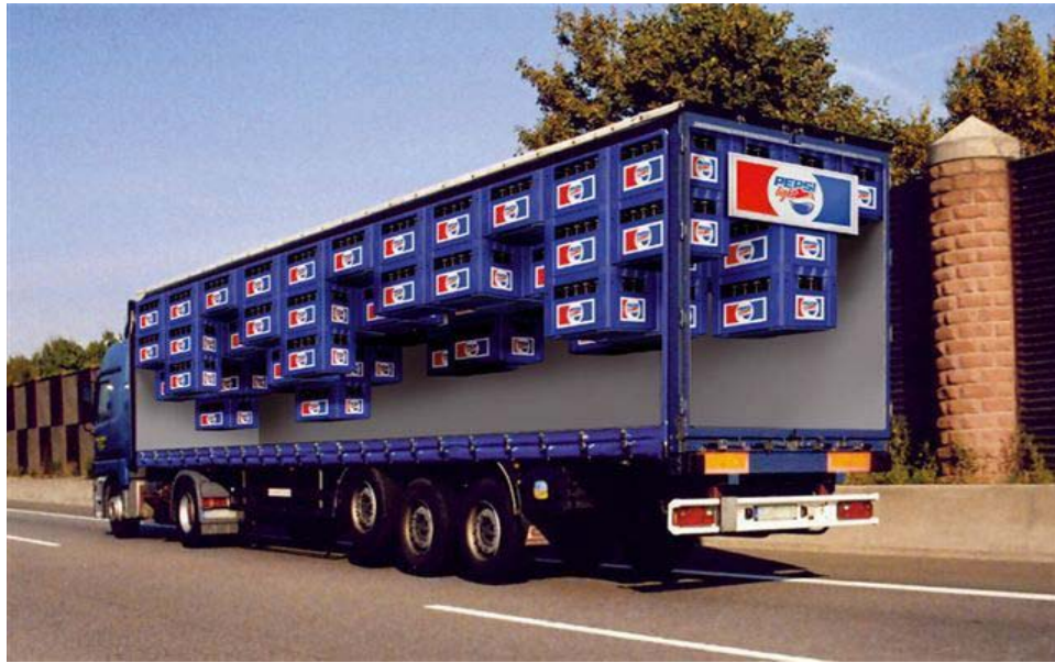
Figure 8. An over-the-road trailer featuring “supergraphic” imagery.

knowledge, digital) have been demonstrated that can convert trucks or large, over-the-road trailers into dramatic mobile visual images. One example is shown in Figure 8.