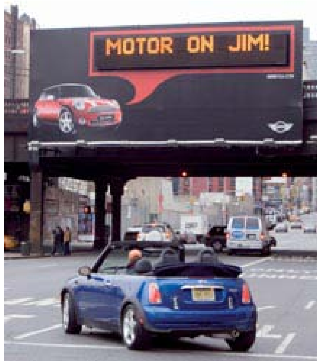
Figure 12. Personalized Mini Cooper billboard.

The popular Mini Cooper automobile, owned by BMW Corporation, has introduced a series of billboards in major US cities that display a static image of the automobile, along with a one line digital display that is normally blank. However, if the owner of a Mini Cooper has “opted in” by expressing an interest in the program, the sign’s digital display will present a “personal greeting” to the approaching driver. Figure 12 illustrates one of these billboards in use in New York City.