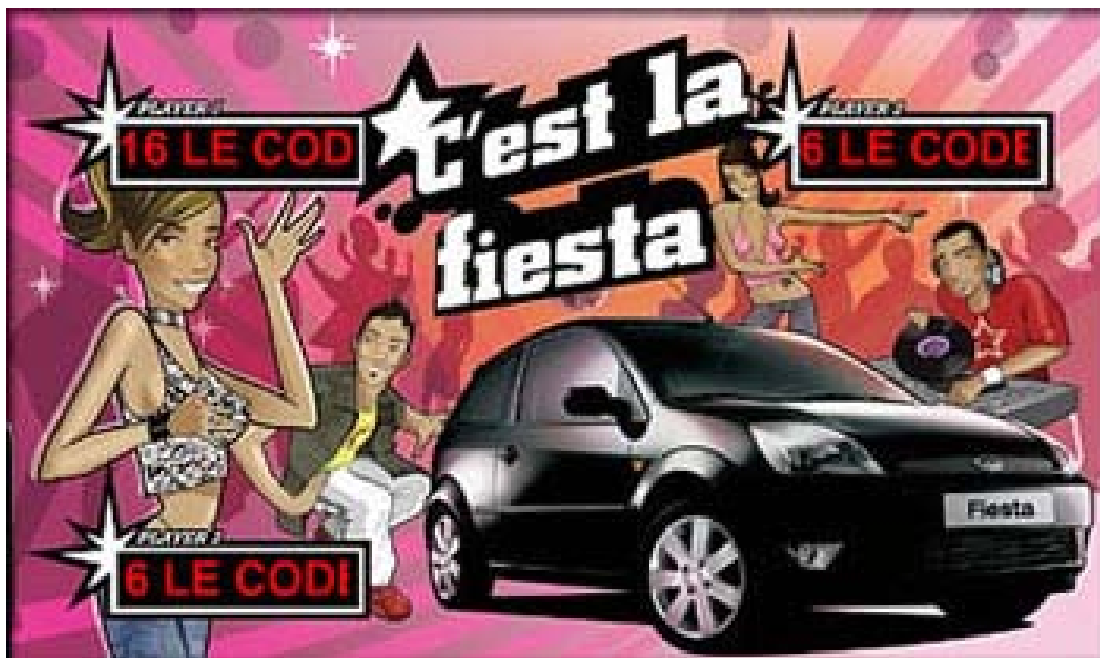
Figure 13. Interactive billboard in Belgium. See text for details of the sign's operation.

In Belgium, as a driver approaches the digital billboard shown in Figure 13 the sign displays a series of codes. The driver chooses one, and sends a text message to an indicated number. The billboard responds by sending a return message containing a question. The driver then texts his answer to the question. The answer, in turn, triggers the DBB to respond like a pinball machine. A correct answer causes the sign to light up, and the driver is entered into a drawing (in this case, for the pictured car); a wrong answer causes the sign to “tilt”