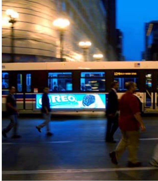
Figure 11. An urban transit bus displaying an LED billboard in traffic.

Although we are unaware of any research that has been conducted to evaluate these mobile display units, it would seem that the potential for driver distraction from the use of this technology within the traffic stream is quite high, not only because the changeable (and video) signs are in physical motion, but also because the presence of the advertising signage at extremely close lateral distances may require an extreme eye and/or head movement for the sign to be seen. 18