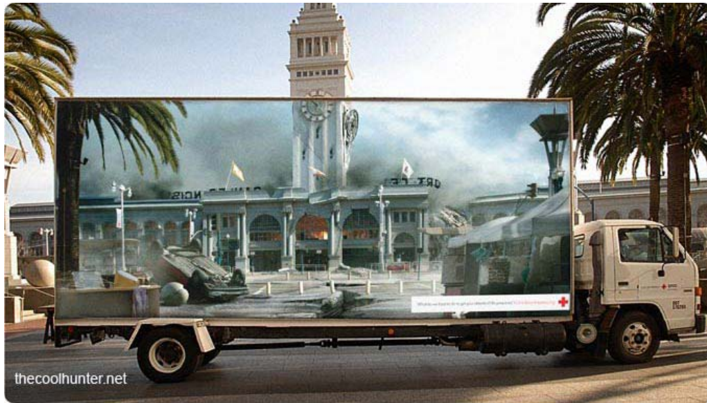
Figure 9a. A mobile billboard from the (San Francisco) Bay Area Chapter of the American Red Cross parked in front of a building, depicting what might happen to that building after an earthquake.