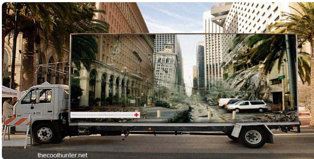
Figure 9b. The same mobile billboard shown in Figure 8a looking in the opposite direction.

In the past few years, a number of products have become available that take advantage of the latest technologies to incorporate LED billboards onto the sides and rear of commercial trucks. In many cases, the sole purpose of such vehicles is to serve as a rolling advertisement; in others, the truck may display advertising while in transit, then park at a specific location to use its large-screen display in support of a concert, sporting event, parade, or other special function. In the latest advances, these signs can be raised electrically or hydraulically above the roof level of the truck; in some cases they can also rotate 360°. One company, named GoVision, advertises that its vehicles can display full