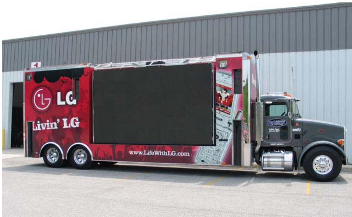
Figure 10. A 40 ft trailer with an integral LED video screen measuring 9x16 ft. The screen shows full motion video while the truck is moving in traffic, and can be raised to a height of 25 ft for viewing while parked.

In other, less dramatic examples, several urban and suburban commuter bus and rail systems have begun to integrate digital billboards onto the sides of their vehicles. Figure 11 shows an urban transit bus displaying a digital advertisement.