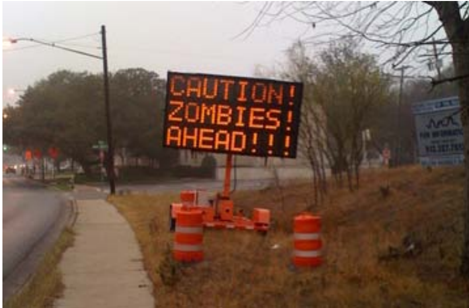
Figure 15. A portable changeable message sign (PCMS) that was “hacked.”

displayed on the signs for their own amusement, political or social purposes, or for other reasons. DBB owners and operators should be alert to these challenges, and should design, develop and implement corrective actions. Government agencies responsible for the regulation and oversight of such signs should ensure that any potential vulnerabilities are protected against.