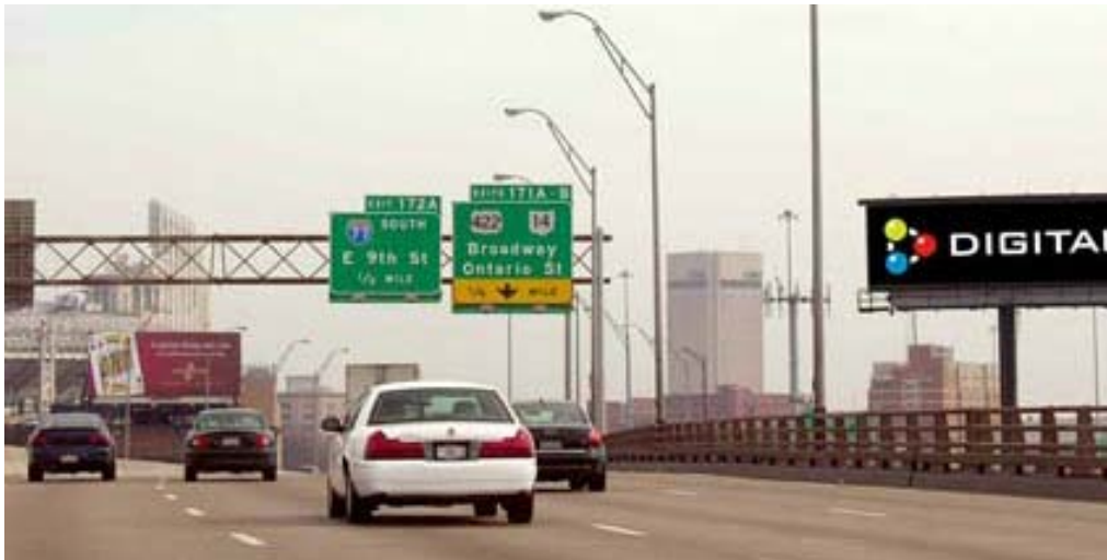
Figure 1. Proximity of DBB #3 to an interchange. This same DBB is shown in Figure 2-8, p. 16, of the Tantala study. It is also Site # 22 from the Lee, et al (2007) study, discussed in detail below.

Figure 1 below, taken from the ClearChannelOutdoor website, shows the researchers’ Billboard Number 3 and its proximity to an I-90 interchange. As discussed above, Billboards 4 and 7 are also close to interchanges. This leads to the rhetorical question – if accidents in the vicinity of interchanges are excluded due to “interchange bias,” and if DBBs are very close to interchanges, how can one capture and analyze accidents that occur close to the billboard? (Note that the authors provide no information about the proximity of any of the DBBs studied to the nearest interchange).