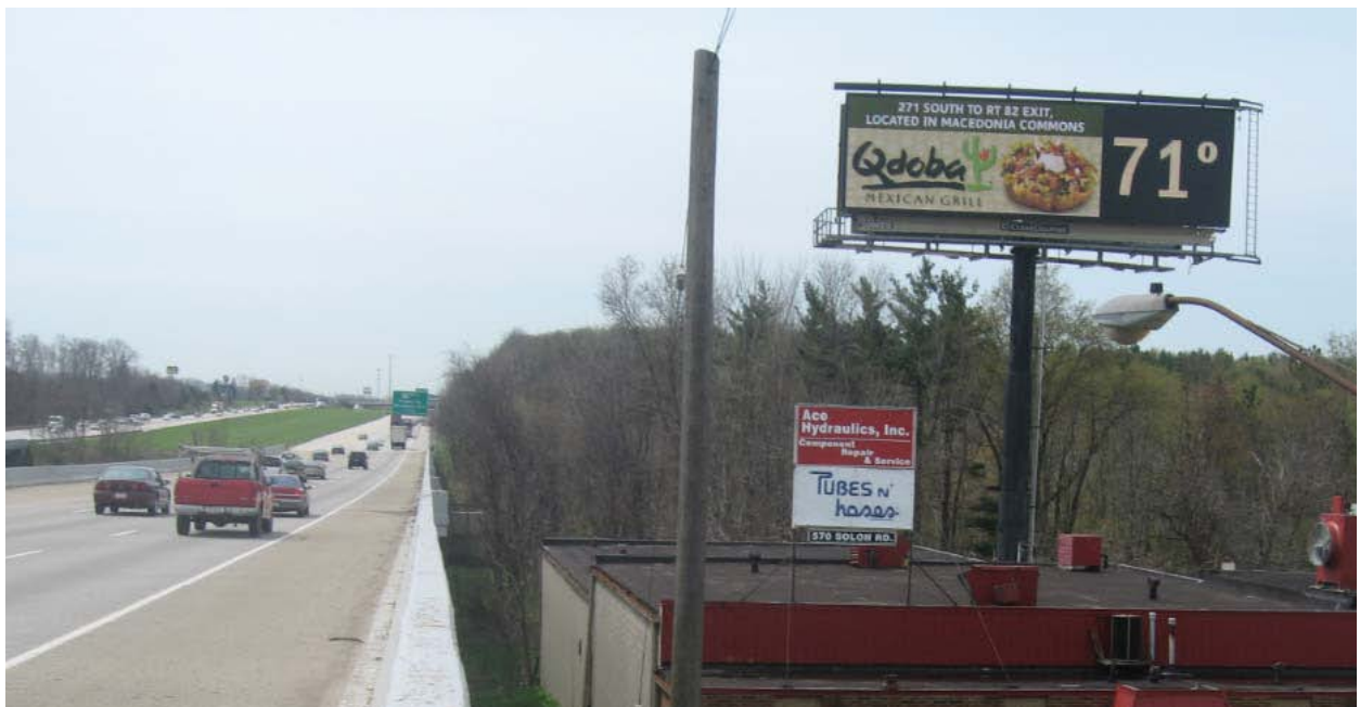
Figure 3. An enlargement of the DBB that served in both the Tantara & Tantara and Lee, et al. studies. Scaled measurement shows the numerals to be approximately 84 in. high.