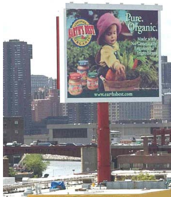
Figure 7. The world’s largest LED sign; an on-premise sign in New York City. The sign measures 90 ft tall by 65 ft wide and is mounted on a 165 ft tall steel post on the roof of building.

driving around the city and suddenly see your work looming over all of this traffic entering and leaving the city” (Black Hammer, Undated).