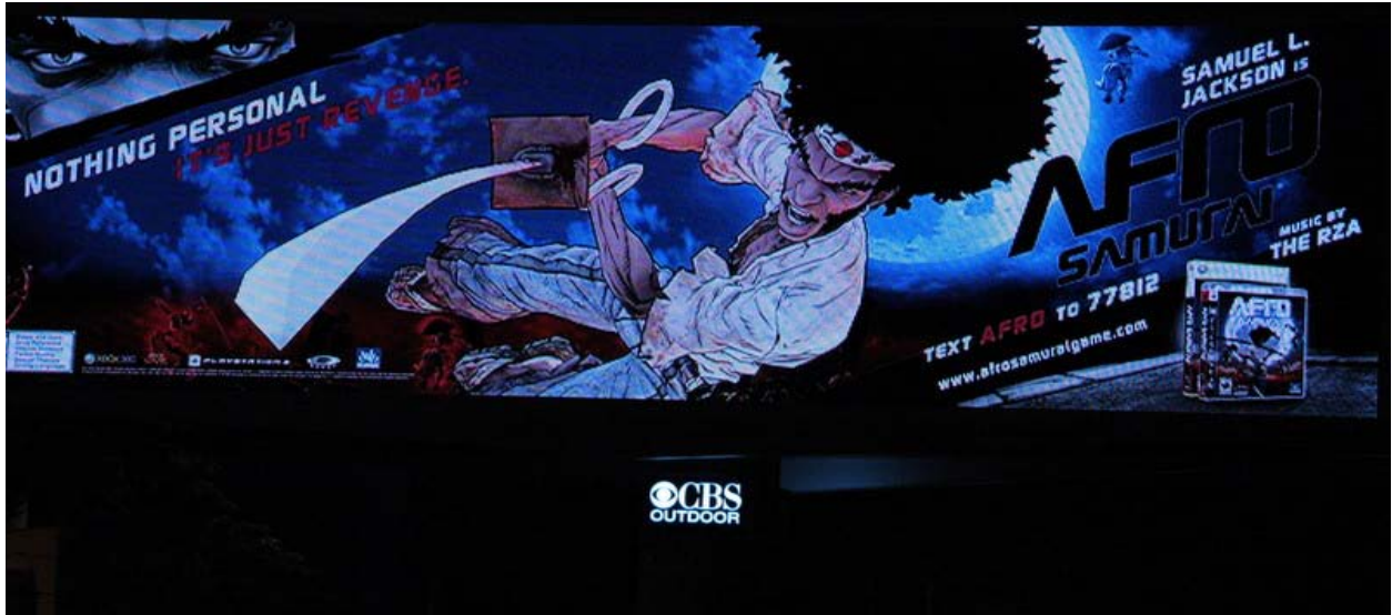
Figure 6. A DBB adjacent to an interstate highway in California. The sign includes an internet address, text messaging instructions, characters in multiple colors, sizes and typefaces, poor figure-ground contrast, and several graphic elements too small to read.