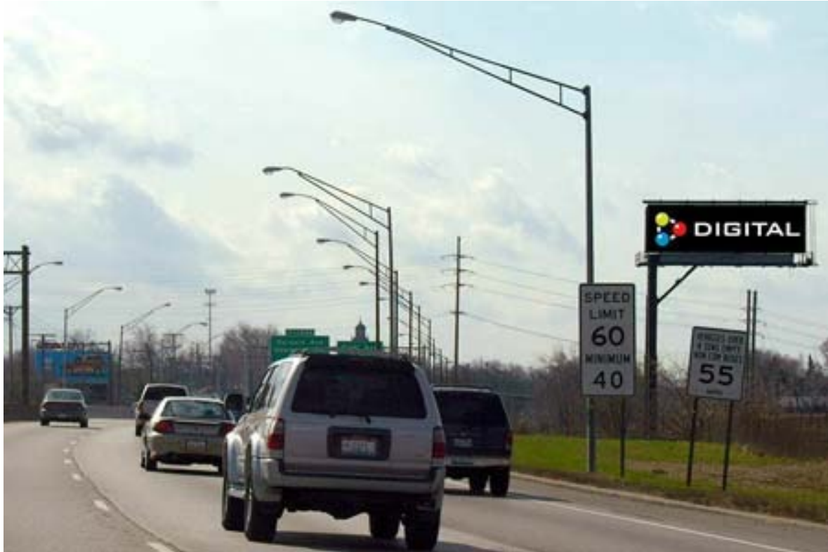
Figure 2. Image showing DBB #4 adjacent to posted Speed Limit signs. This image shows the same DBB depicted in Figure 2-10, p. 17 of the Tantala study. Interchange signs can clearly be seen, as can an additional billboard in the driver's view. This is the same sign represented as Site No. 42 in the Lee, et al. report discussed below.

The authors fill their report with information irrelevant to the study, while ignoring information of interest. For example, on pages 23-27 and in Tables 3-1 and 3-2, they describe in detail the total number of miles of interstate highways in the state and county, the terminus of each roadway, and the base and surface type of all pavements. On pages 29-31, they provide cursory information about the location of each of the studied billboards – again providing data on road surface and previous state work projects, and repeating, verbatim, information already presented on pages 10-11. However, no information is given about relevant concerns such as horizontal and vertical curvature, merges or lane drops, presence of official signage, proximity of DBBs to interchanges, multiple billboards within a driver's line of sight simultaneously, or intersection characteristics such as entrances, exits, gores, etc., either for the system as a whole or within the vicinity of the studied DBBs.