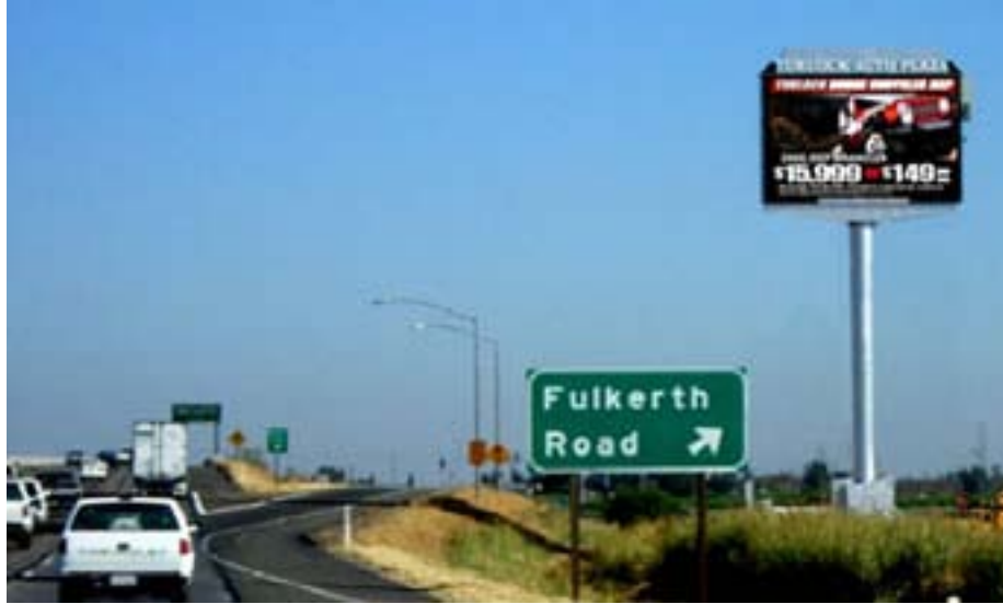
Figure 14. A “smart” DBB in Turlock, California

Many digital billboards have been equipped with video cameras that can record approaching traffic. A recent service aimed at the outdoor advertising industry permits an inconspicuous billboard-mounted camera, supplemented with an infra-red surround lighting device, to record the eye-movements of drivers approaching the sign (Skeen, 2007). Although this service is currently offered as a means to demonstrate to sign owners the amount of driver attention being given to their sign and its specific messages, it is a small technological step to combine these eye movement recordings with other demographic or personal information to target personalized messages or provide other “services.”