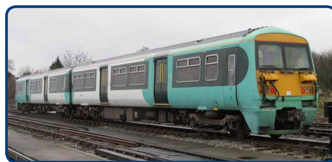
A two carriage 456 train as it will appear before refurbishment.

There are no on-board toilets and no First Class.