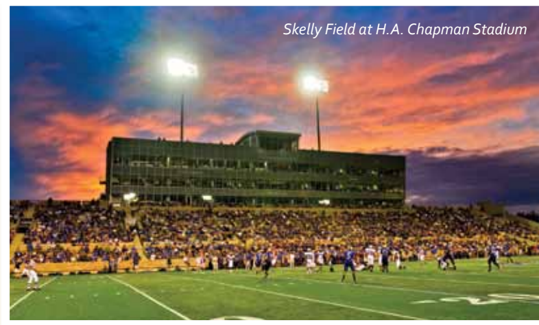
Skelly Field at H.A. Chapman Stadium

What a year for Golden Hurricane Athletics! The year began in August with a 4-0 women's soccer victory over Northwestern State and ended in June with all six spring sports competing in national championship events, as the men's tennis team advanced to the NCAA "Sweet 16" and the softball team was one win away from reaching the NCAA "Super" Regional. Tulsa added to its' already league-leading Conference USA championships with six league titles and one shared Western Division crown in football, and now has won 34 C-USA championships in six years as a league member. In addition, TU student-athletes earned nine All-America honors and 99 All-Conference USA selections — to name just a few of the accomplishments. It's been an incredible year of tremendous team performances and outstanding individual efforts. We hope you've enjoyed these memorable moments and had an opportunity to witness some of them in person. Now, join us in taking a look back at 2010-11.