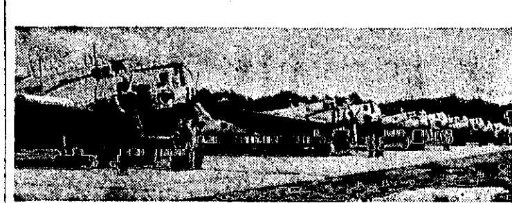
Light army bombing planes on guard. They'd harry enemy ships.

A view from atop Ancon hill just before the last lights were ex tinguished in Panama's first blackout. On the left are the lights of Miraflores locks. The outline of the canal can also be seen, a narrow thread of water which is Uncle Sam's "lifeline."