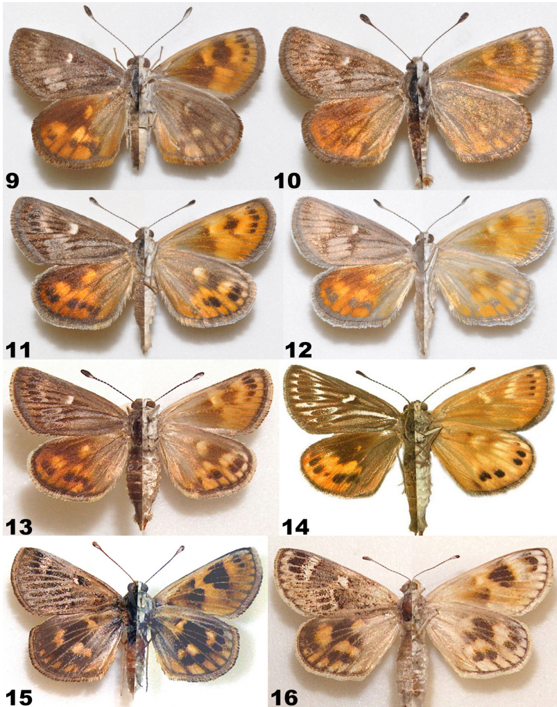
Figs 9-16. Synemon spp., upper and undersides. (9-13) S. theresa : (9) typical morphology (m) (broad FW) 34 mm Waterfall Gully (WG) SA 8.i.1997; (10) ‘mopsa’ morphology (m) (narrow FW) 30 mm WG SA 23.i.1998; (11) typical form (f) 32 mm Morialta SA 23.i.2011; (12) pale form (f) 34 mm Morialta SA 23.i.2011; (13) dark form (f) 36 mm Stoneyfell SA 30.xii.1940. (14) S. collecta (f) SE Qld. Sept-Oct. (15-16) S. selene : (15) dark form similar to syntypes (m) 50 mm Two Wells SA 4.iii.1948; (16) pale form (f) 50 mm Two Wells SA 4.iii.1948.