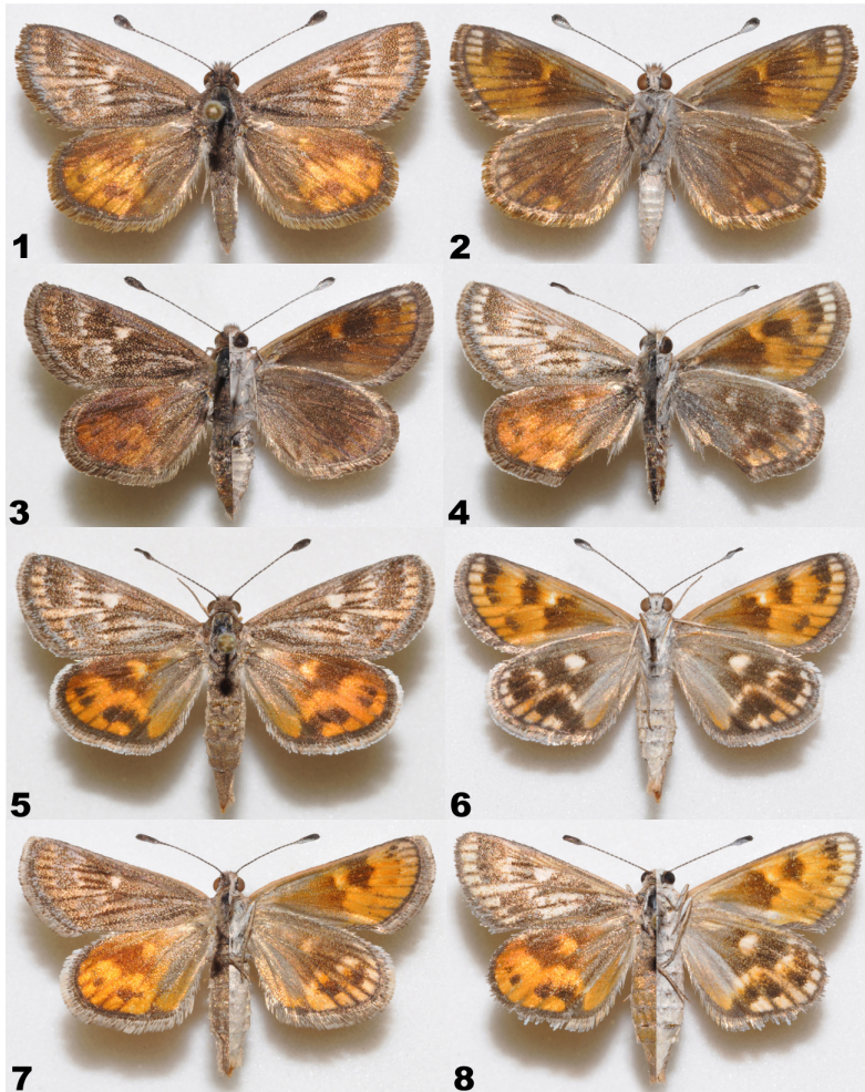
Figs 1-8. Synemon colona sp. n., upper and undersides: (1-2) holotype male (m) wing expanse 26 mm; (3) paratype (p) (m) dark form 26 mm; (4) paratype (p) (m) pale form 26 mm; (5-6) paratype (p) typical form (f) 26 mm; (7) paratype (p) (f) dark form 26 mm; (8) paratype (p) (f) pale form (worn) 26 mm.

end constricted; proboscis absent; eyes smooth, reflective eye pattern pale grey Type III when alive; antennae reach beyond the discal cell (dc) end or about 0.6 the length of the forewing (FW) costa, shaft scaled, dark brown black above, paler beneath becoming white near club, narrowly ringed white