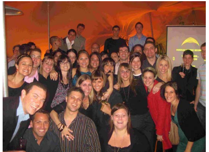
Class of 1999 get together in Cape Town (above).