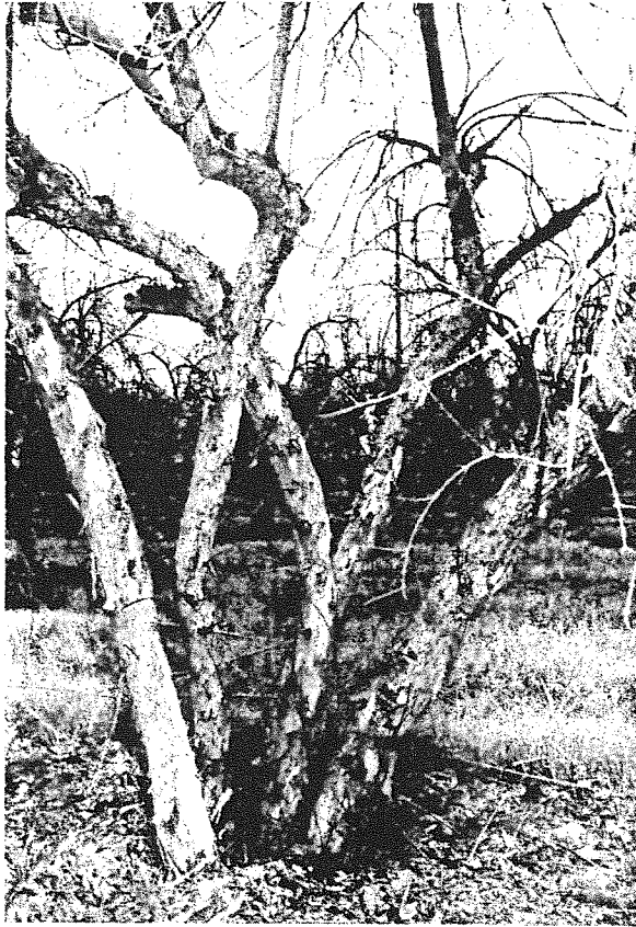
Pomegranate tree trained to a multiple trunk.

base of the tree. If a single trunk tree is desired, only one vigorous sucker or the trunk of the original nursery tree should be selected and branches grown from it. Basal suckers should be removed periodically to promote growth from the main trunk of the newly planted tree.