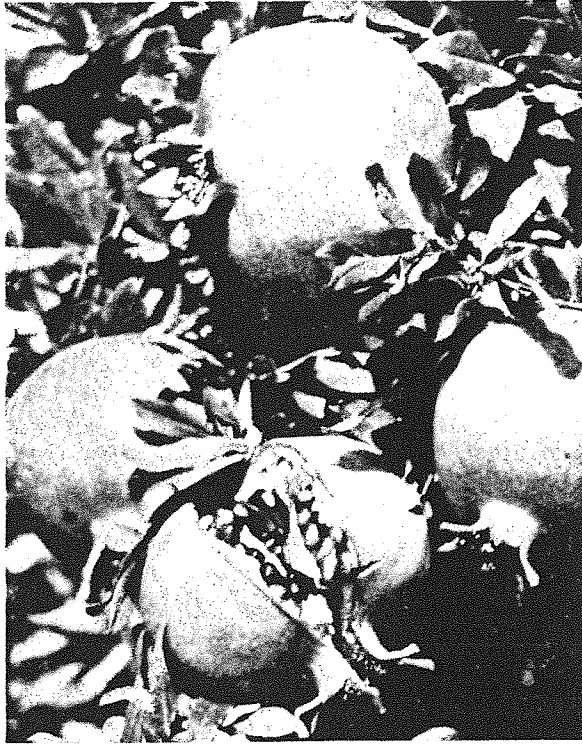
Cluster of maturing pomegranates. Note split fruit in center of cluster

Pickers harvest fruit with clippers and bags like those used to pick oranges. For shipment, fruit is packed into 25- to 28-pound net Los Angeles lug boxes by size, and fruit may be waxed to enhance the appearance; it can be held in cold storage for several weeks without losing market quality. Fruit continues to develop to a darker skin color when held at room temperature, and may last several weeks in decorative arrangements.