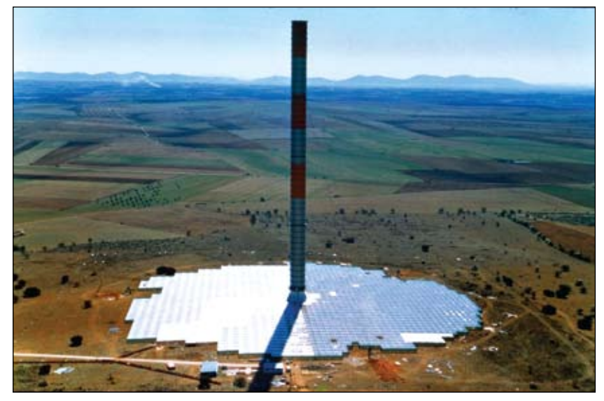
Fig. 3: The prototype solar chimney.

various heights to damp a whole range of complex vibrations that could otherwise destroy the tower when sudden gusts or storms buffet it. These spokes will have to withstand corrosion for more than a century, and even stainless steel may not prove tough enough, perhaps titanium or even platinum might be needed.