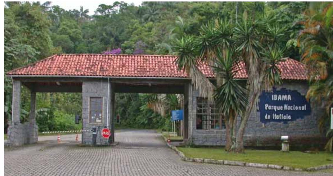
Entrance gate of Itatiaia National Park