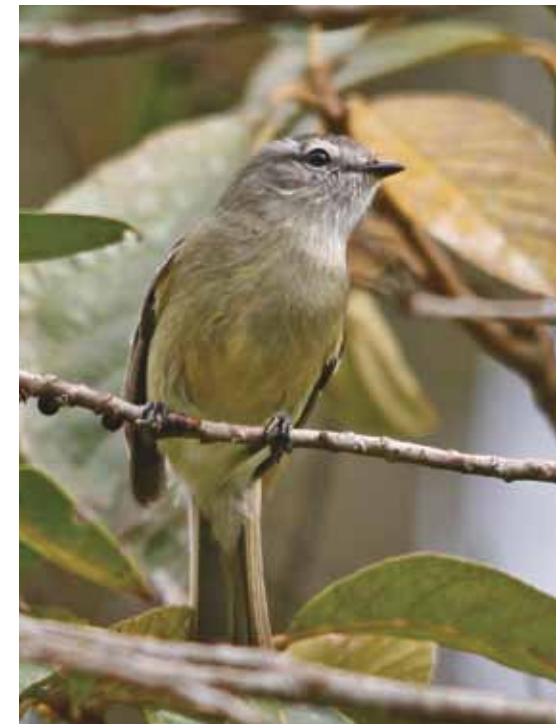
Planalto Tyrannulet Phyllomyias fasciatus

The main birding area is around the hotels. The longest and maybe the best trail, the Três Picos trail, starts from the Itatiaia Park Hotel (ex-Hotel Simon). It goes for some 5 km to the peak, Três Picos (1,750 m), through fine forest. Along the trail