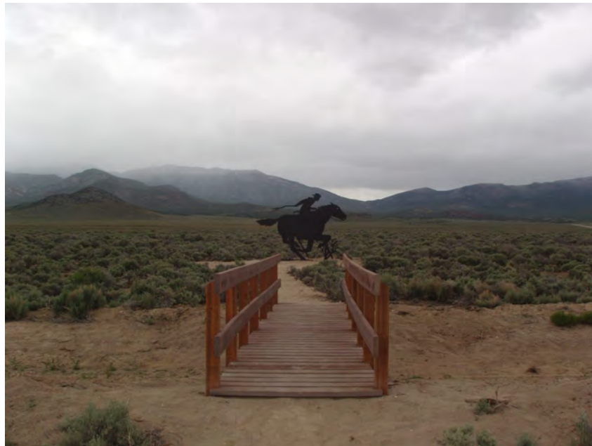
Pony Express monument, Ely District