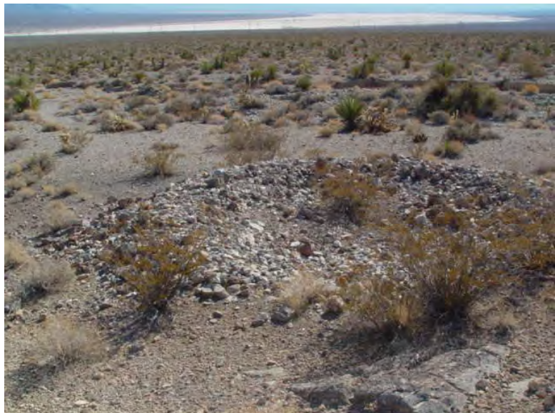
Agave roasting pit, Southern Nevada District

Inventories that result in negative findings or the discovery of isolated artifacts only shall be reported using the Cultural Resource Negative Report or Cultural Resource Isolate Report, respectively (Appendix E). GPS, mapping, and illustration standards detailed in appendices F-H apply.