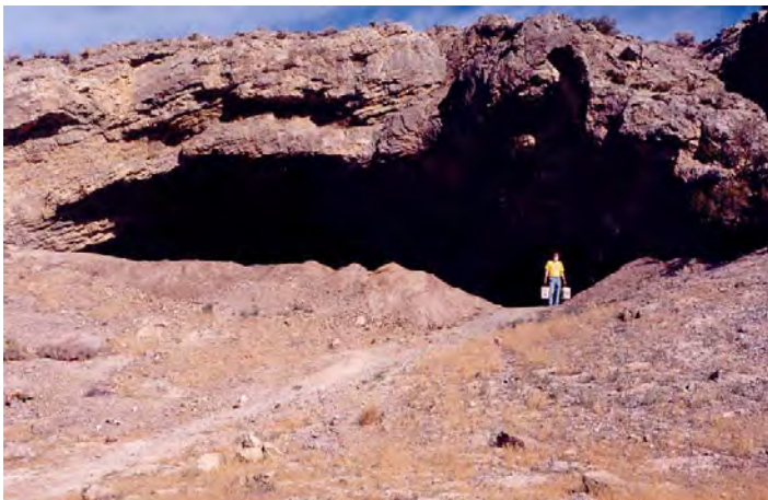
Bonneville Estates Rockshelter, Elko District