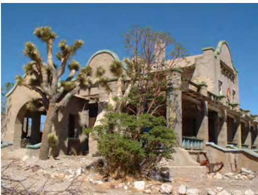
Las Vegas & Tonopah Railroad Depot, Rhyolite; Tonopah Field Office

The proponent is also responsible for complying with all stipulations in any BLM approved treatment plan relating to the proposed action, and with certain exceptions is responsible for funding and implementing the treatment plan.