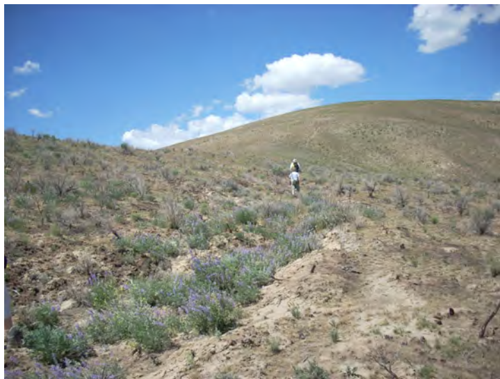
Section of the California Emigrant Trail, Elko District

A land use applicant who terminates the services of a permittee may substantially increase the amount of time and cost required to produce a Section-106 compliant report, and therefore would substantially increase the amount of time before any Notices-to-Proceed could be issued for a project.