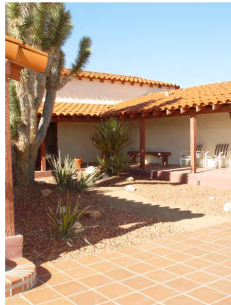
Walking Box Ranch, Southern Nevada Dis- trict. Listed on the National Register of Historic Places.

Section 112(a)(1)(A): Each Federal agency that is responsible for the protection of historic resources, including archaeological resources pursuant to this Act or any other law shall ensure all actions taken by employees or contractors of such agency shall meet professional standards under regulations developed by the Secretary in consultation with the Council, other affected agencies, and the appropriate professional societies of the disciplines involved, specifically archaeology, architecture, conservation, history, landscape architecture, and planning.