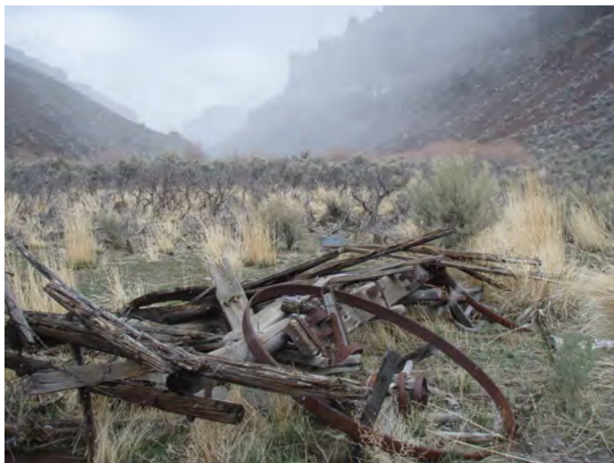
Remains of historic ranching wagon, Winnemucca District