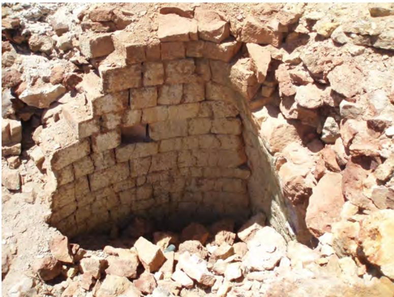
Lime kilns near Dayton, Carson City District