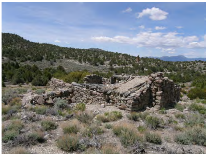
Crescent mill, Caliente Field Office

Sketch maps should convey information about the site at an appropriate scale. This information provides a visual reference for information provided elsewhere in the report and site form.