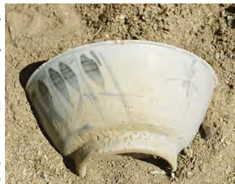
Historic Chinese bowl, Battle Mountain District

Ceramic chronologies within the Great Basin are also not well understood, in part due to the variability in local materials used in production and the relatively small amount of ceramics recovered to date. Fremont ceramics includes at least five cultural variants (see Section 2); the Great Salt Lake variant is most likely to be found in the project area, as it extends from the Great Salt Lake to southern Idaho and northeastern Nevada (Madsen 1986); it is a good temporal marker of the Late Archaic, as it appears to date between 1450 and 650 BP (Madsen 1986). Paiute-Shoshone