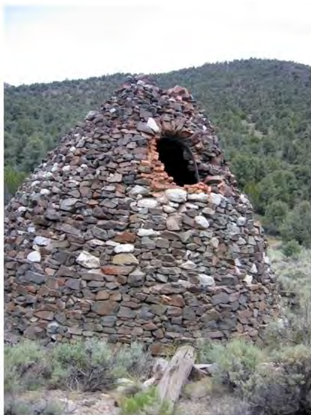
Tybo kiln, Battle Mountain District

Deviations from Class III standards (e.g., Class II sample survey) may be approved, on a case-by-case basis, by the BLM Office having jurisdiction in consultation with SHPO. Approval must be obtained prior to initiating field work through the CRINA process. A detailed justification for adopting alternative field methods, and an inventory plan, must be provided to the BLM Office when requesting deviations from the Class III standard and be included in the draft and final inventory report. The proponents failure to allow sufficient lead time for a Class III inventory will not be considered adequate justification for completing less than the Class III standard.