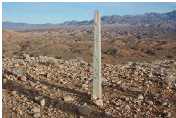
Old Spanish Trail marker, Mormon Mesa–Virgin Hill, Southern Nevada District

consistent with practices and policies in BLM Manuals 8120 and H-8120-1.