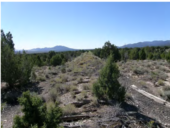
Prince Mine to Pioche shortline railroad, Caliente Field Office