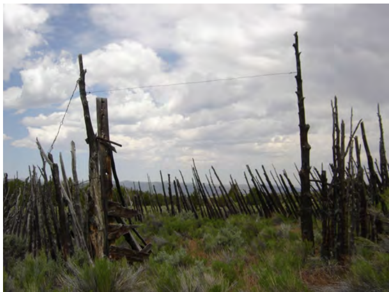
Historic horse trap, Battle Mountain District