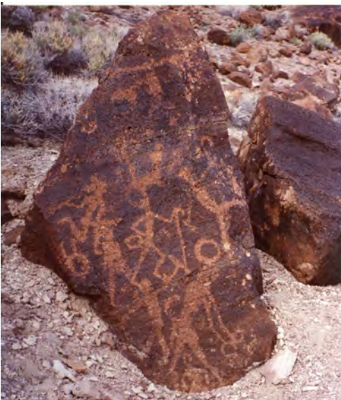
"Kane Man" petroglyph panel, Tonopah Field Office