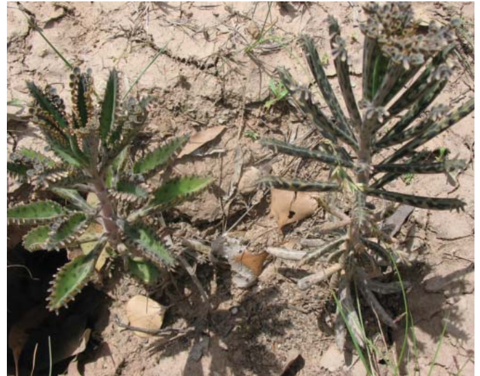
South African citrus thrips adult

Further information is available from your local government office, or by contacting Biosecurity Queensland (call 13 25 23 or visit our website at www.biosecurity.qld.gov.au ).