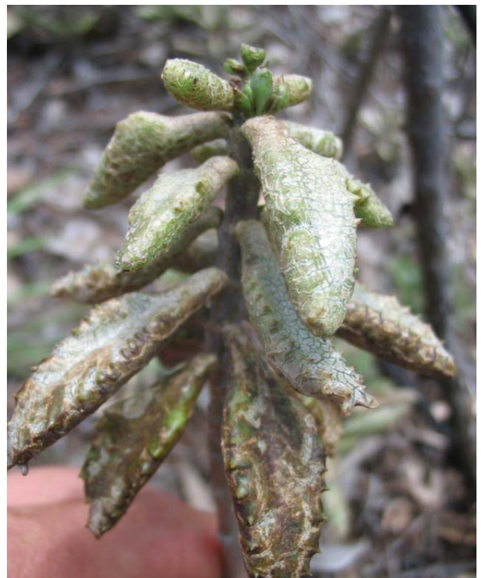
South African citrus thrips damage to mother-of-millions