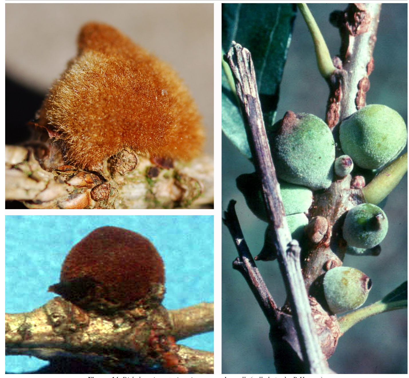
Figures 14. Disholcaspis costaricensis, new species, galls.