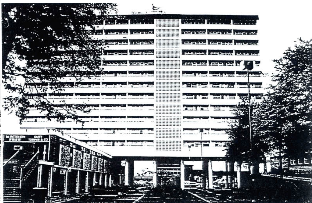
Cambuslang: opportunities for public participation in the preparation of the local plan and town centre forum

The right approach to public participation could help revitalise the planning system. Scott Davidson reports on an initiative being devised in Scotland