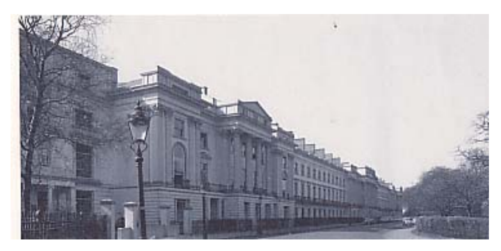
Regents Park Conservation Area, Cornwall Terrace, NW1

considered. Proposals affecting listed buildings should be discussed with officers from the City Council and from English Heritage (see addresses at the back of this leaflet). It is a criminal offence to demolish all or part of any listed building or structure without having first obtained listed building consent.