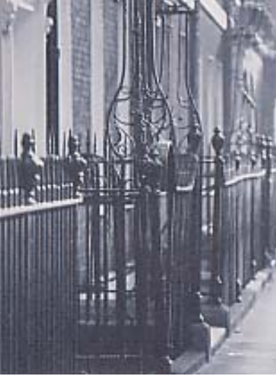
Covent Garden Conservation Area, Covent Garden Piazza, WC2 (photo, 1984)

Mayfair Conservation Area, Cha Street, W1