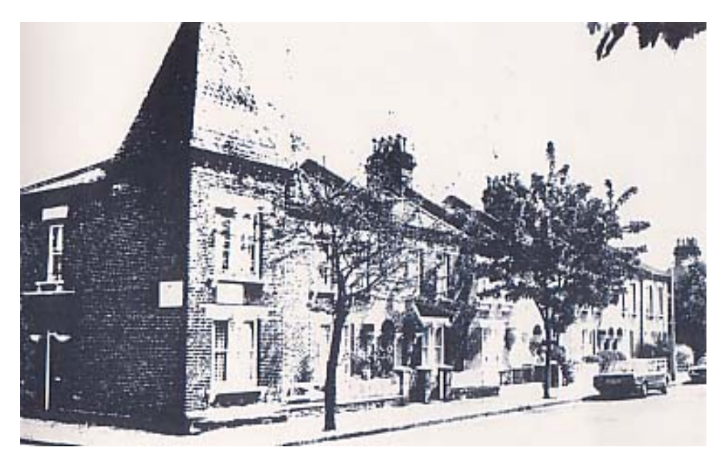
Queen's Park Estate Conservation Area, W10