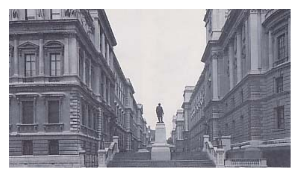
Whitehall Conservation Area, King Charles Street, SW1

All new development within conservation areas should be closely integrated into its surroundings. Within areas of uniform townscape new development should respect the proportions, form and characteristics of adjoining buildings. In some areas good modern design is often acceptable if disciplined by its townscape context, and is preferable to pastiche (the superficial use of architectural detail). The higher the quality of areas of unified townscape, the greater the discipline that should be placed on new development. In many groups of buildings where the architecture is strongly unified, replica facades may be the most appropriate design solution, if development can be accepted in principle.