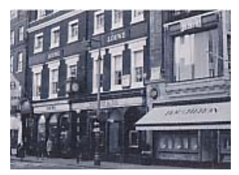
Mayfair Conservation Area, Old Bond Street, W1

Local authorities have additional powers in conservation areas over the type of advertisements that require advertisement consent. A separate guidance note is being published by the City Council on this subject and specific policies for advertisements are contained in the Unitary Development Plan. Advertisements should always be sympathetic to and in scale with the appearance of the conservation area.