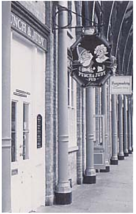
Covent Garden Conservation Area (former Market Building), WC2