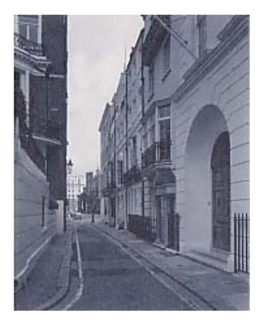
St. James's Conservation Area, Cleveland Row, SW1

The notes for applicants accompanying the City Council's planning application and conservation area consent forms state what information is required. In drawing up proposals for development you should take into account the fact that the City Council will expect a high standard of design, materials and detailing in order to preserve or enhance the character of the particular conservation area. Development proposals close to conservation areas will be also assessed in terms of their impact upon the adjacent conservation area.