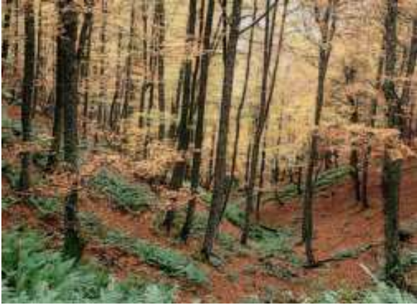
Bosque atlántico J. M. Fernández Díaz-Formentí