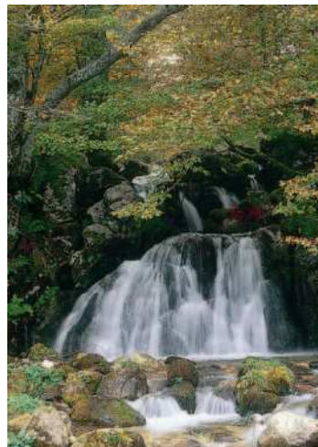
Valdevezón waterfall J. M. Fernández Díaz-Formentí

Redes is located in the northern slope of the eastern Cantabrian Cordillera in the upper basin of the Nalon, one of the rivers with the most discharge in northern Spain. The territory includes the whole of the Caso and Sobrescobio Councils, with altitude variations ranging from the River Nalon at 350 m to 2,104 m at the Pico Torres. The landforms are steep with deep ravines and spectacular waterfalls such as those along the Ruta del Alba. The ecological importance of the Biosphere Reserve is noteworthy for its vast forest masses of autochthonous Beech and Oak that are in a good state of conservation enabling emblematic species to survive, such as the Brown Bear, the Western Capercaillie, the Royal Eagle, the Egyptian Vulture, the Middle Spotted Woodpecker, etc, and also for its production of water resources that supply water to the whole central Asturian watershed.