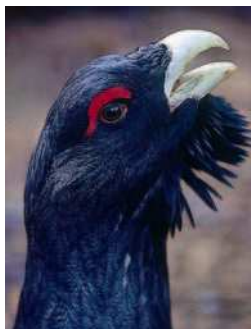
Western Capercaillie J. M. Fernández Díaz-Formentí

Farming, forestry and conservation, hunting and fishing, industrial facilities, equipment and services, public use, education and research. Some unique architecture is noteworthy such as the stone cabins with slate roofs, located in the high valleys of the summer grazing lands and the traditional stone granaries. Herds of the endangered Casina cattle or Asturian mountain cattle are to be found in Redes, and their milk is used to make the famous Casin cheese.