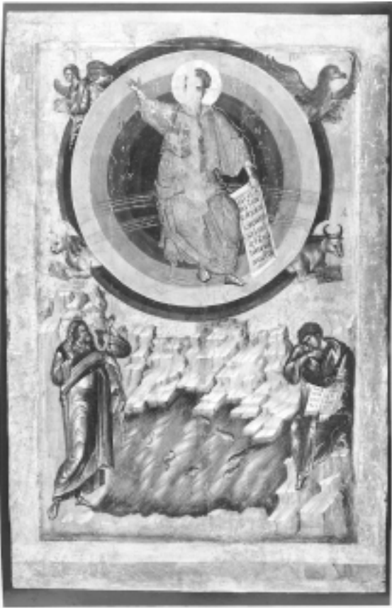
1 Sofia, crypt of the cathedral of Alexander Nevsky, the Poganovo icon. Theophany of Christ