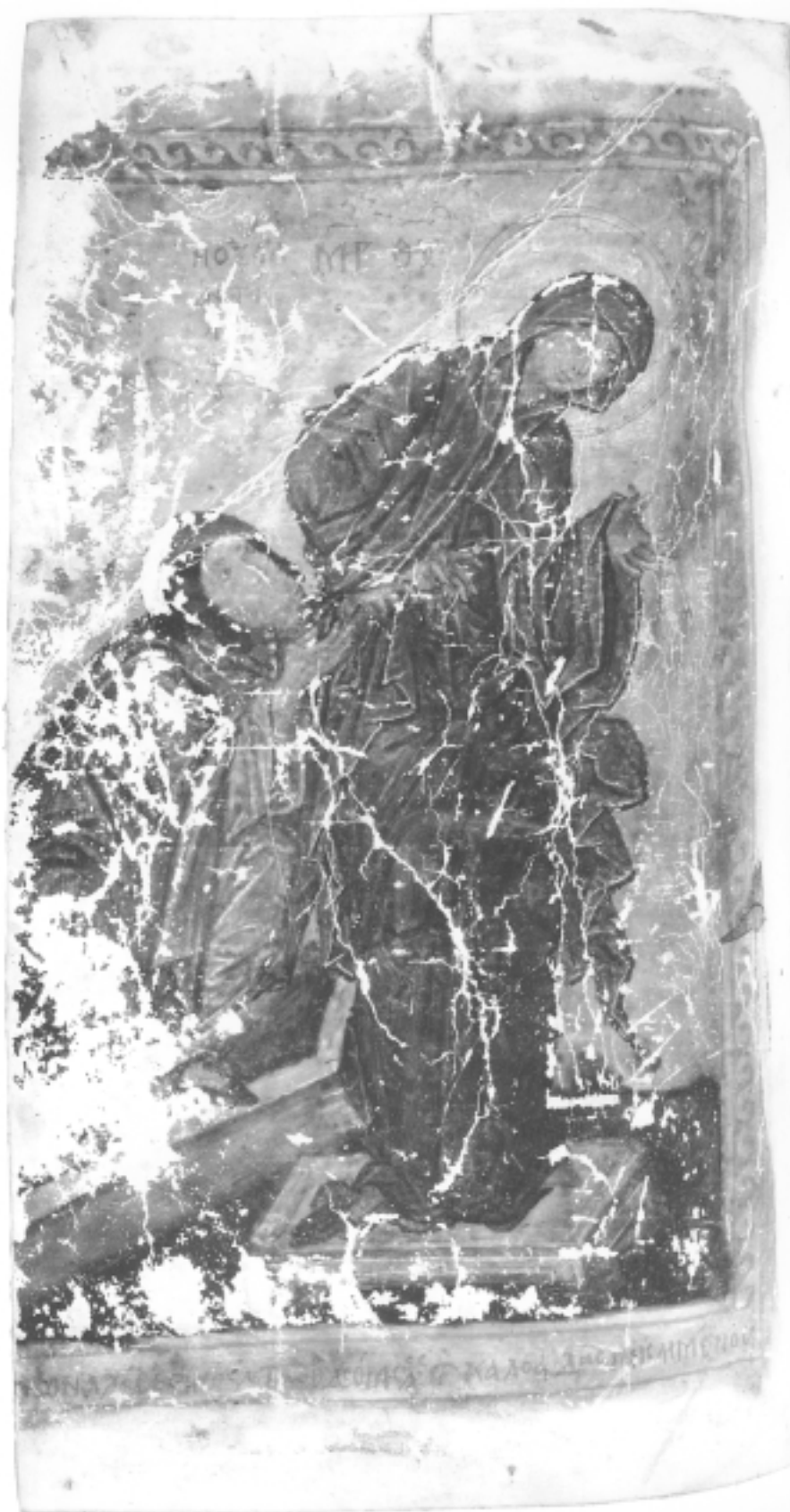
10 Oxford, Christ Church gr. 61, fol. 102v, the Virgin pulling the monk Kaloeidas from the tomb