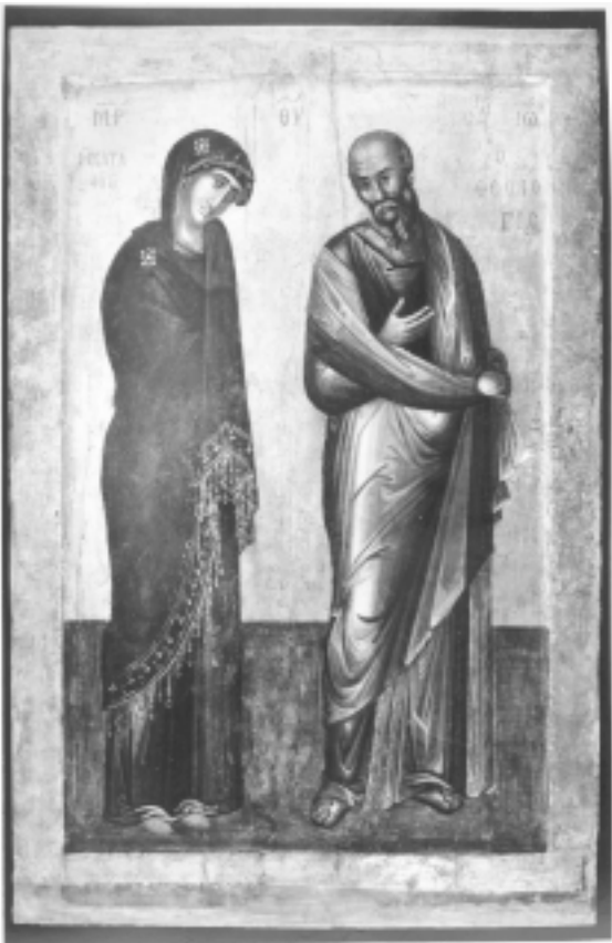
2 Sofia, crypt of the cathedral of Alexander Nevsky, the Poganovo icon. The Virgin Kataphyge and John the Theologian