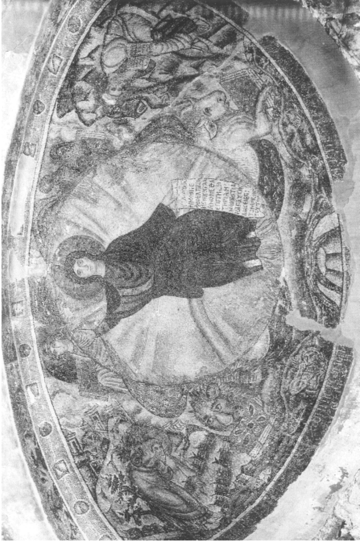
5 Thessalonike, church of Hosios David, monastery of Latomos, Vision of Christ in Majesty, mosaic in the apse (after N. Chatzidakis, Byzantine Mosaics , Greek Art [Athens, 1994], 40, fig. 11)