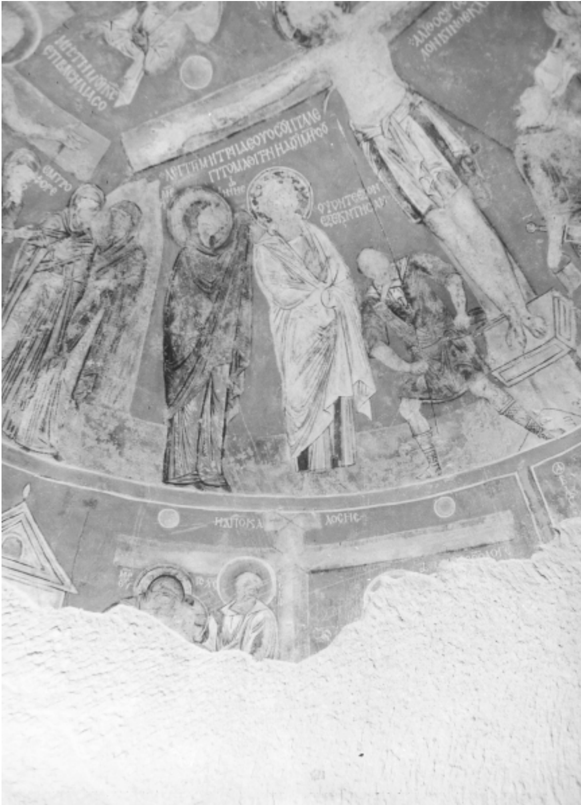
3 Göreme Valley, Tokali Kilise, Crucifixion, fresco in the apse