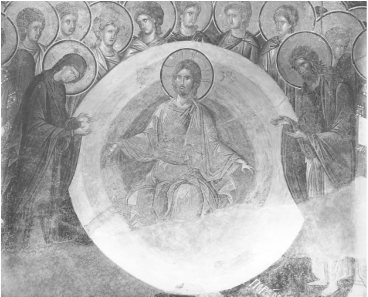
11 Istanbul, Kariye Camii, fresco of the Last Judgment