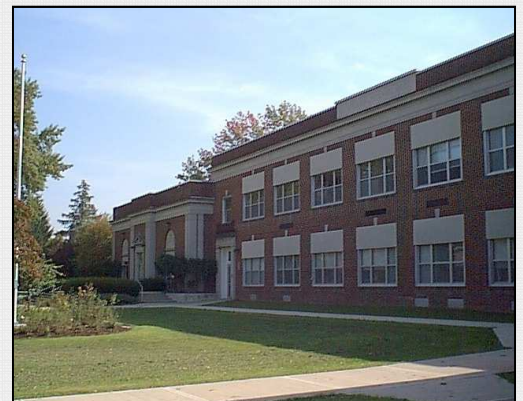
Lewisburg Area High School