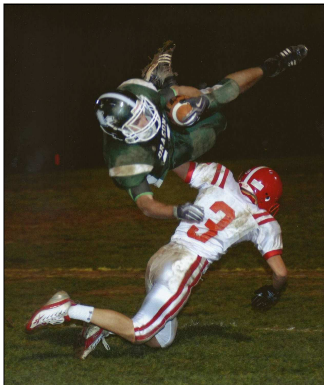
The continued resurgence of Lewisburg football captured the hearts and minds of the school and community in 2009. The boosters helped purchase a new lineman's chute for the team, a critical new piece of training equipment.

We want to thank every individual who supported us with their time and money over this past year. If you are not already doing so, please consider joining us now! Your gift is an investment in our student-athletes and the programs that afford them the opportunity to have defining experiences in school. We need your support! Please also consider volunteering to help us. Concession stands and merchandise sales are a great way to meet fellow alumni and parents. Just indicate your willingness to help on the form included in this newsletter and someone will get in touch with you!