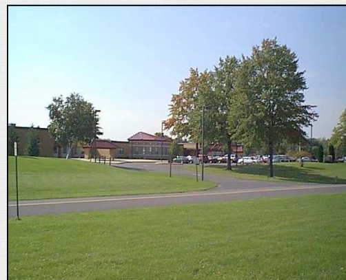
Donald H. Eichhorn Middle School