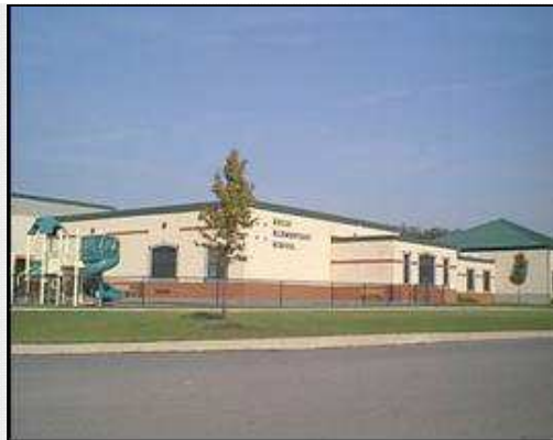
Kelly Elementary School