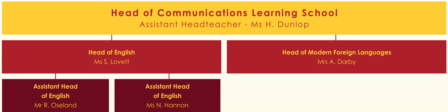
Above: Highfields' Communications Leadership Structure