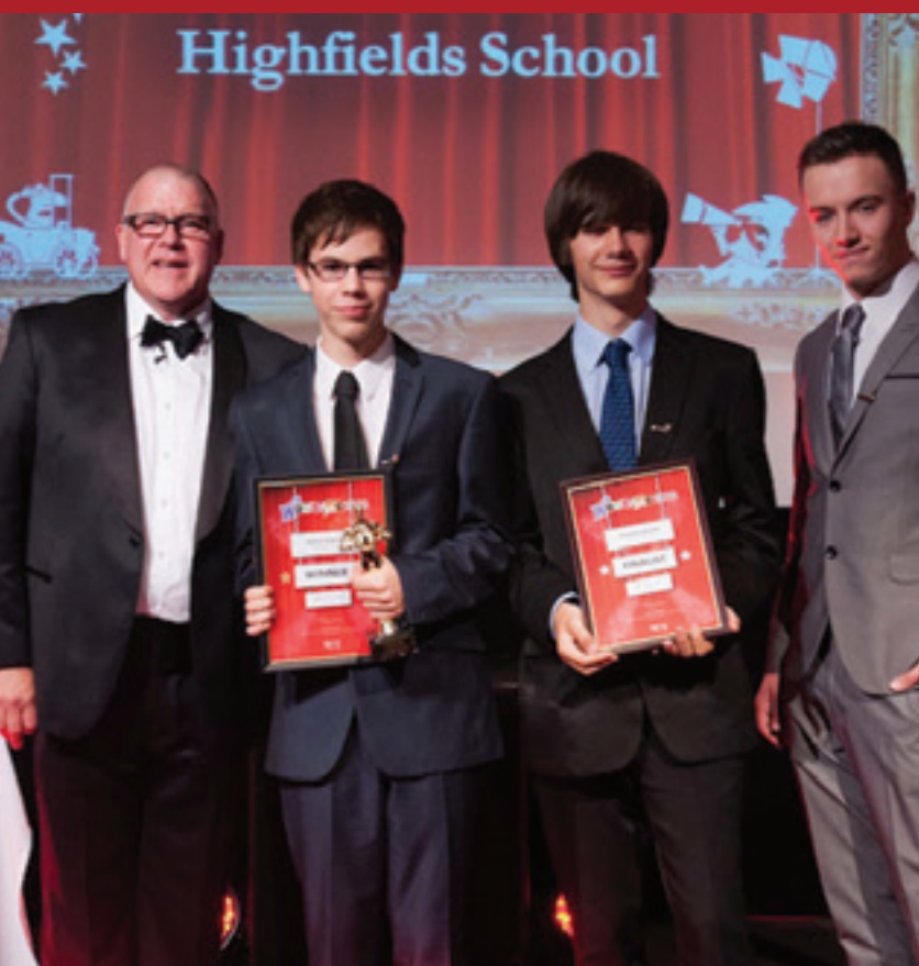
The WOSCARS 2013