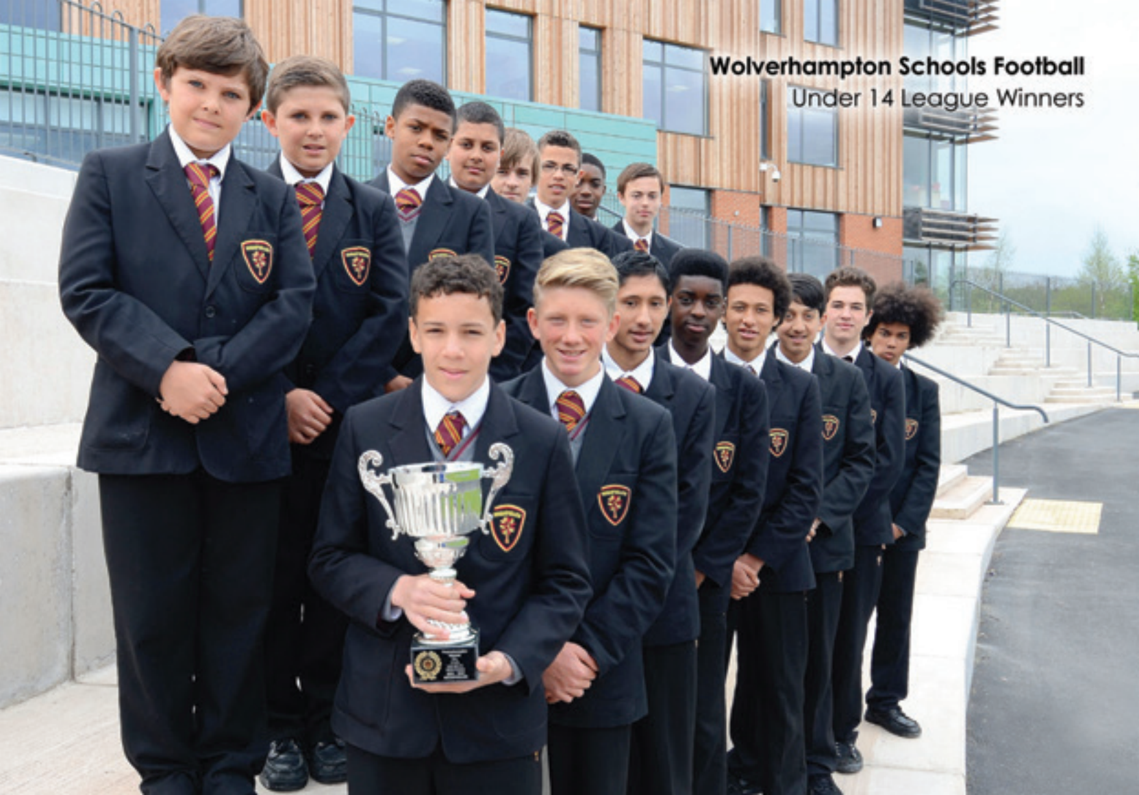
Wolverhampton Schools Football Under 14 League Winners