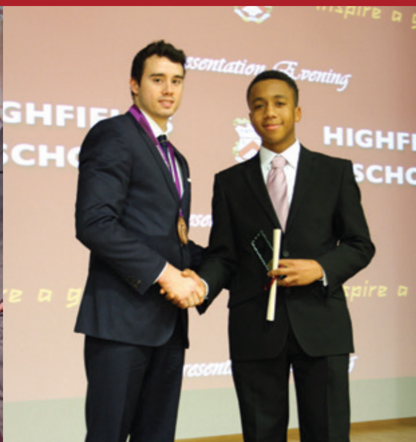
Presentation Evening 2012