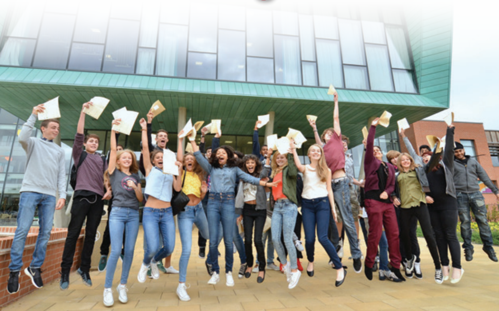
Highfields achieved its best ever GCSE results this year