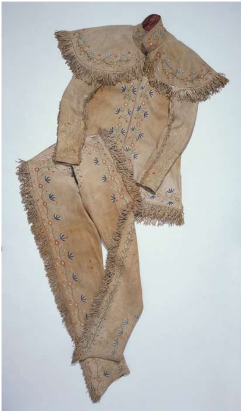
Museum of the American West, Autry National Center; 94.6.1.

Cherokee beaded buckskin suit including shirt and pants, c.1820 to 1840.