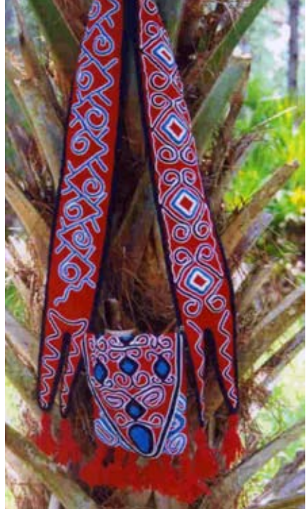
Southeastern beaded bandolier bag by David Mott.

Many early beads were integrated into surface designs on clothing and accessories where the aesthetic components of vivid color and appealing texture were richly expressed in ceremonial ensembles and objects of ritual and display. While beads and beaded objects were used by young and old alike, the greatest quantities and those made of the most exotic materials were linked with powerful, high-ranking chieftom leaders, such as the Lady of Cofitachequi. The importance of regional bead use is further underscored by being associated with supernatural figures described in mythology, including the Falcon Impersonator, Bead Spitter, and Serpent Dancer. The concept of beads extended even to the sacred landscape where the earth was sculpted as a series of mounds, referred to as "The String of Beads" or "String of Pearls" (created at present-day Ashland, Kentucky).