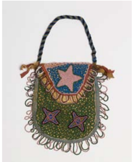
Small beaded purse, Cherokee style.

than our beadwork. When our ancestors saw those sparkling, brightly colored glass beads, they loved them. They incorporated them into styles and motifs that had been traditions among the Southeastern people since long before Christopher Columbus ever set sail. Our beadwork, given its merging of ancient design and construction with then-modern materials, is a visual metaphor for the time in which it was made. At a time when we were merging our blood, our tools, our living structures, our family structures, our governmental structures and our religious beliefs, our beadwork illustrated these rapid changes to Cherokee culture and our ability to survive and adapt.