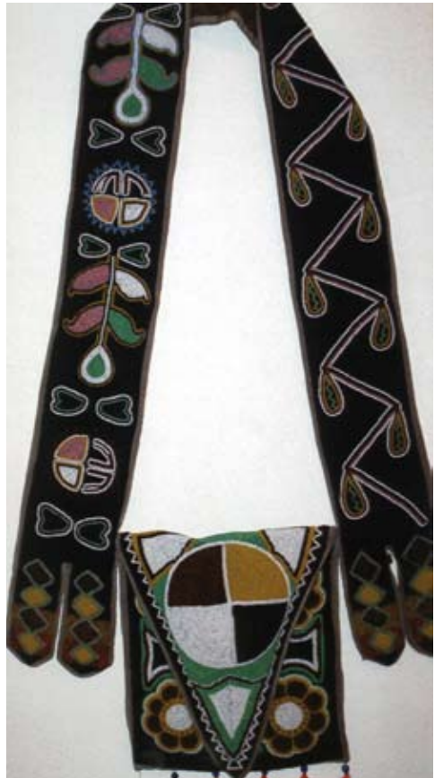
Southeastern beaded bandolier bag by Julie Perkins, Cherokee

One of the beadwork items made today is the rosette; these are attached to powwow regalia or worn singly as a bolo. This modern version of the gorget evokes the round silver gorgets worn during the 1700s, which