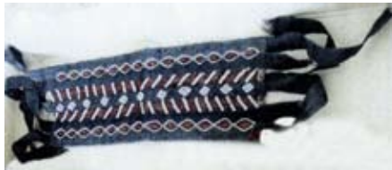
Creek applique beaded garters. Red Velvet with navy blue cut away braid, applied with white seed beads.