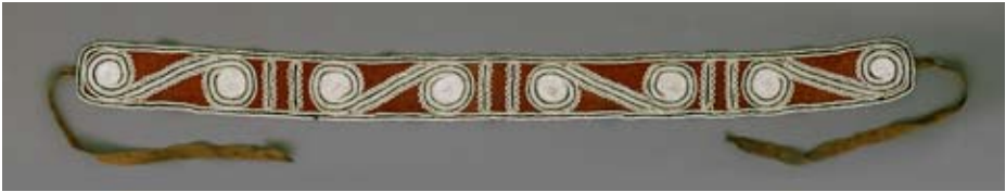
Choctaw Sash, 1825-1850