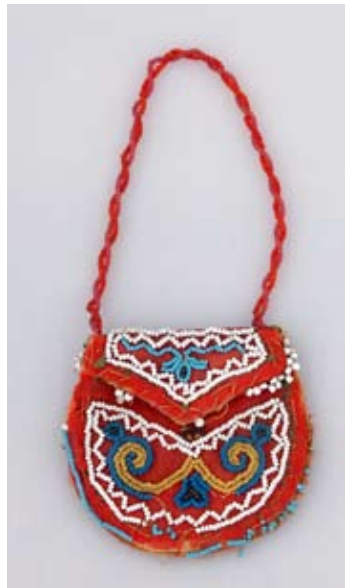
Small, two-sided applique beaded Cherokee purse, c. 1820s.