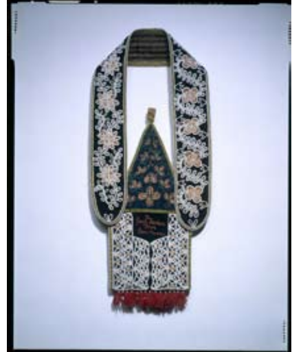
Navy blue bandolier bag, floral, applique beaded and embroidered.

This bandolier bag was almost certainly made by a Cherokee, and is an example of beadwork used in diplomacy. On the pouch, under the flap, is the following inscription: To Gen'l Jackson, From Sam Houston.