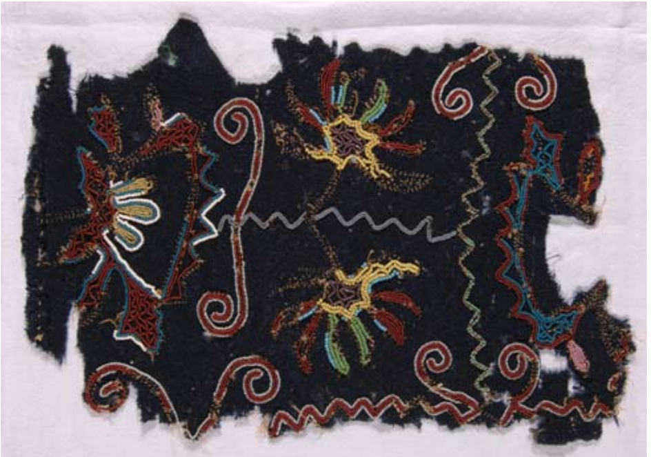
Cherokee applique beaded mantle fragment. The mantle was carried and worn on the Trail of Tears and is still in the possession of the descendents of the original owner.

When the great powwow culture began to grow, its roots were in the ceremonies of the Plains nations. Consequently, the regalia that evolved with the powwow movement also had roots in the Plains. Images of powwow dancers, in Plains