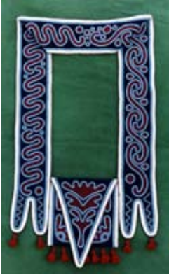
Beaded Bandolier bag by Jerry Ingram, Choctaw/Cherokee

“Formerly the Stomp dancing tribes of the Southeast, now resident in Oklahoma, wore ceremonial dress in the dance. For the men this might consist of a handkerchief, otterskin, or finger-woven sash turban with a silver headband worn over it and an ostrich plume or eagle feather in the back; a fancy shirt and ruffled coat of cloth; the Southeastern style triangular flap shoulder pouch with its decorated shoulder strap; a finger-woven yarn sash with large end tassels, worn over the shirt and coat; a decorated breechcloth; and buckskin or cloth leggings with finger-woven or beadwork kneebands. Moccasins were of the soft-soled Woodland type, either puckered to a single seam up the top of the foot, or with an inset tongue. These moccasins had large ankle flaps, either plain or decorated. . . . This colorful garb, sad to say, has passed away. One hopes that a revival of interest may some day bring back the old styles.”