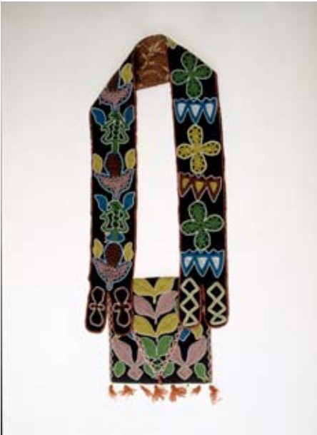
Cherokee bandolier bag.

Copyright Harvard University, Peabody Museum Photo 41-62-10/23538 T1674