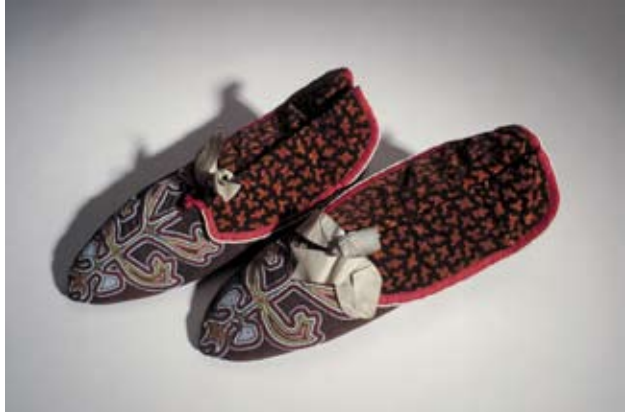
Catalog number 50/859 AB