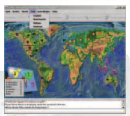
Connecting for network play with JTEG