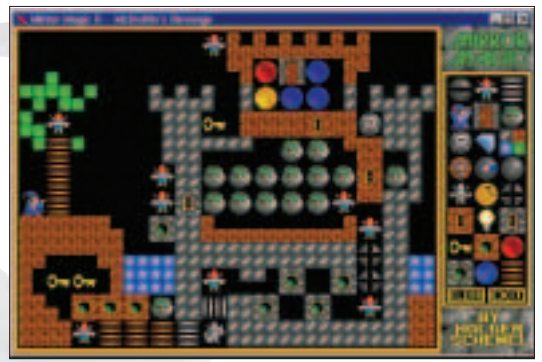
Mirror Magic's level editor

Simple principles can often lead to a lot of fun and Mirror Magic is no exception to this rule. Just like Rocks'n'Diamonds, Mirror Magic also provides nice graphics, sound effects and music. In fact both games have a suspiciously similar look, which is no coincidence since Rocks'n'Diamonds is based on the engine of Mirror Magic. Their relationship goes as far as the version number, which – at the time this column was written – is 2.0.1, released on March 19th 2002 for both games.