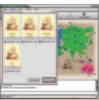
Different map with playing cards for T.E.G.

times during its development, it has been under continuous development since early 2000. It currently contains three maps, is capable of network play and has translations into Spanish, French, German and Polish