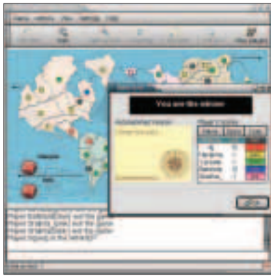
Conquer the world the T.E.G. way

Although the project was declared dead many