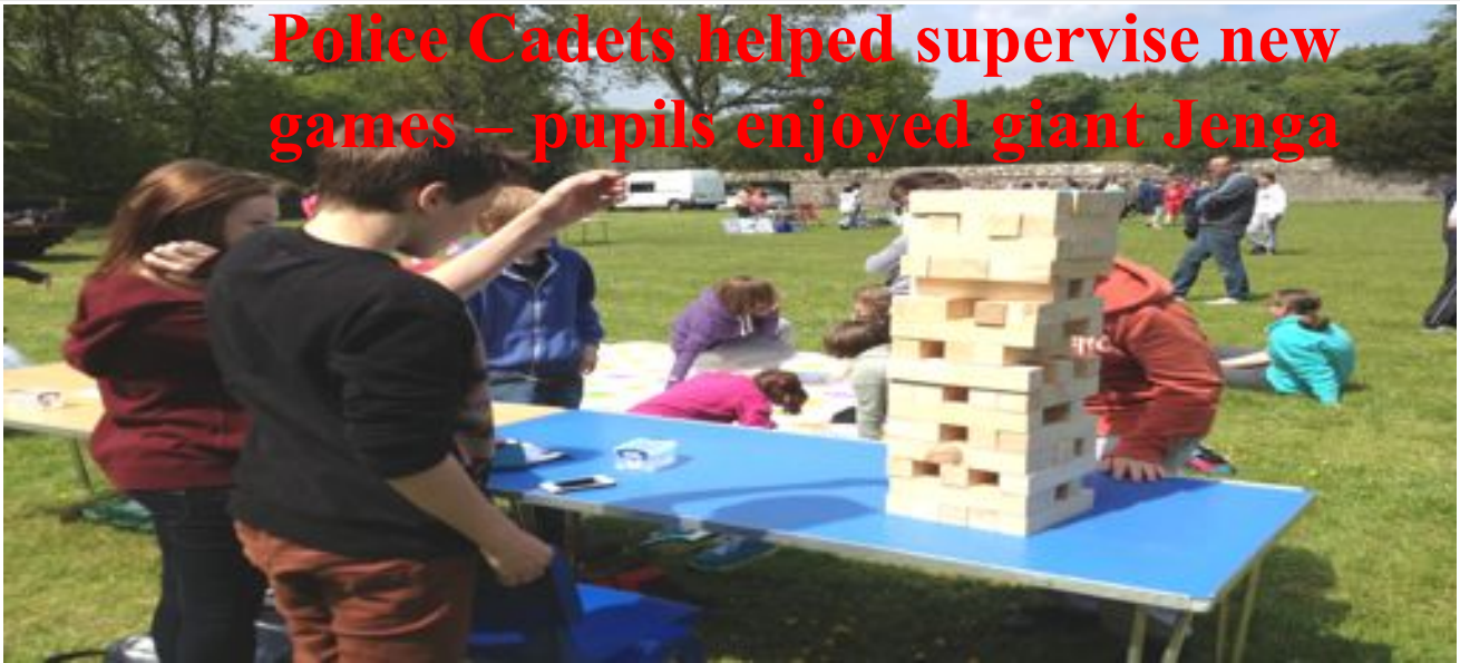
Royal Signals Army Reserve Unit, Aberdeen helping the school