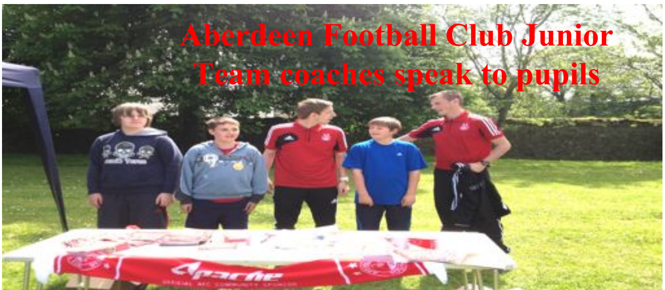
Aberdeen Football Club Junior Team coaches speak to pupils