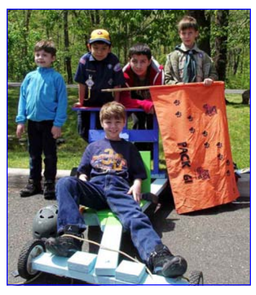
Pack 61 Norwalk at the Cubmobile.