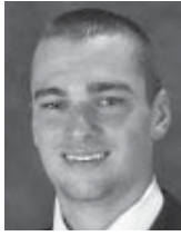
97 Jack Russell K