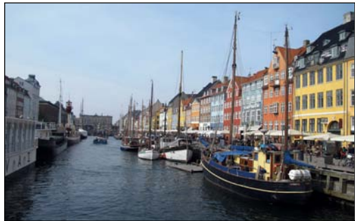
Copenhagen, host for the EWB-International Conference