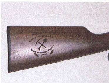
Stock of the 30-30 Winchester.

(Purchasing these tickets is not considered a charitable donation)