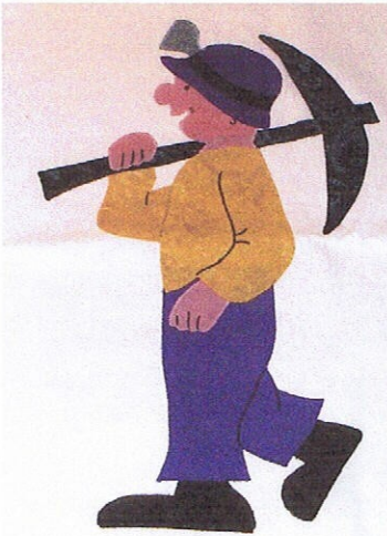
Miner from the corner of the quilt.

packet. This packet will contain information for the day and "goodies" donated from various businesses and families.