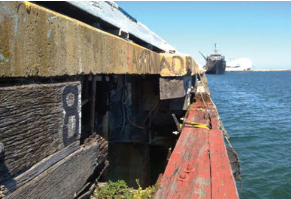
Current condition of E Berth fender

A wharf upgrade that started recently at Victoria Quay will involve installation of a new fender system at E Berth and part of D Berth.