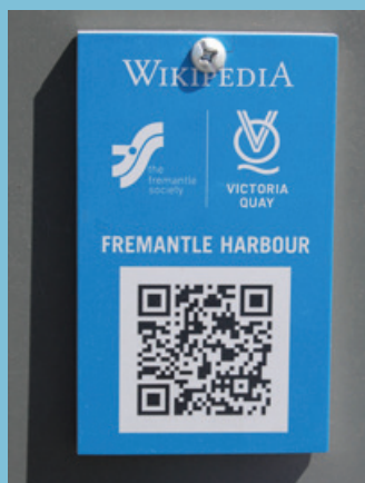
The QR code plaque for Fremantle Harbour on signage near B Shed

QR (quick response) code is the trademark for a type of matrix barcode first designed for the Japanese automotive industry.