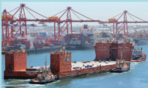
The world's biggest heavy lifter, Gavea Lifter, passes busy container berths on North Quay

Semi-submersible barges are used for the dry transportation of floating units, as well as for dry-docking large objects in remote areas where no suitable dock is available.