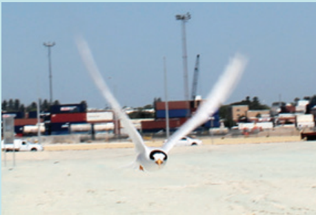
A fairy tern flies towards the photographer for a closer look

Fairy terns have been nesting in sand at Rous Head on the area that was reclaimed as part of Fremantle Harbour deepening in 2010. While most of the land is being developed for port-related purposes to support the container trade, an area is being developed for public open space and a fairy tern nesting area. Recently, fairy terns took advantage of the wide open spaces of sand that have not been developed yet. Fremantle Ports is providing the fairy tern nesting area with expert advice from an ornithologist from the WA Museum.