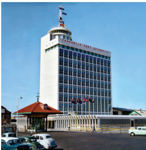
The epitome of modernity in 1964

Fremantle Ports' iconic administration building, standing high and proud on Victoria Quay, was the epitome of everything modern when it was opened on 5 March 1964, as is illustrated by an historic photo display opening to the public on 7 March.