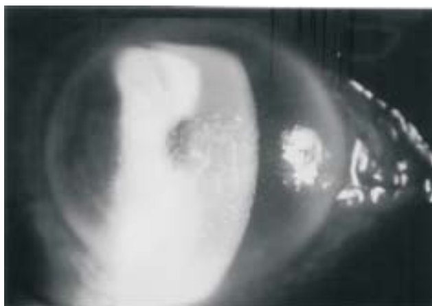
Fig. 2. Case 1. A 70 year-old male with corneal punctate erosions, underlying stromal edema, and Descemet's folds, 18 hours after exposure to E. tirucalli sap.

had been laid the day before. He paid little attention to it initially because the juice was mistaken for dew. He experienced severe burning pain, redness and marked lacrimation despite immediate rinse with tap water. He visited an eye doctor, who did irrigation again. However, his vision deteriorated at night and he was referred to our hospital in the next day. On examination, the visual acuity in his left eye was 6/20. The conjunctiva was mildly injected and the cornea showed microbullae, marked stromal edema, and Descemet's folds. The intraocular pressure, anterior chamber and fundus were normal. Topical 0.02% fluorometholone eye drops, 0.25% chloramphenicol eye drops and 0.3% gentamicin ointment were prescribed. Two days later, the stromal edema and Descemet's folds diminished markedly and his vision recovered to 6/8.6. Specular microscopy revealed symmetrical endothelial cells morphology and numbers in both eyes. His vision returned to 6/5 and the cornea had full recovery in a week.