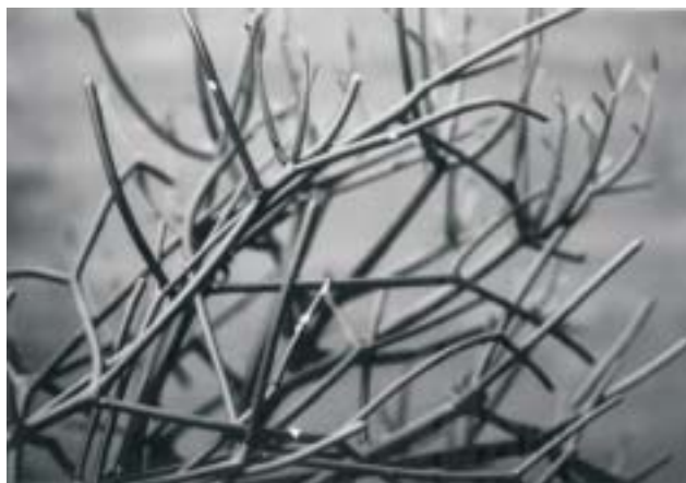
Fig. 1. Euphorbia tirucalli with free-flowing sap.

A 40-year-old man accidentally had Euphorbia tirucalli juice squirt into his left eye while he was trimming grass, where some pruned-away twigs of Euphorbia tirucalli