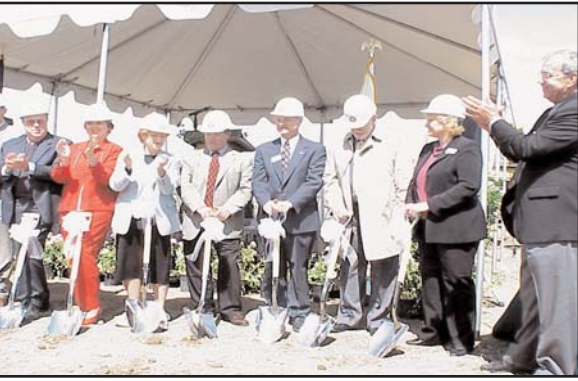
City Officials and Ventura County Supervisor preparing to break ground in 2005

This has been a great and very successful endeavor.