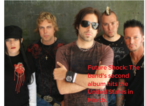
Future Shock: The band's second album hits the United States in March.

• Also staying quiet is EMI Music Canada, this