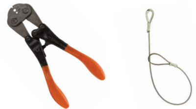
The Nicopress tool and a typical 2 mm wire rope assembly.

These are great tools for onsite rigging jobs. Ideal for dinghy and small yacht rigging but also for control lines and lanyards. The system is widely used on small aircraft so you can be sure of a really reliable compression. We have tested them ourselves and the wire always breaks before the termination. We also stock the micro cable system with wires as small as 0.26 mm diameter. These are perfect for invisible display purposes. The 1 mm and 2 mm stainless wires make useful small lanyards. We will make them for you if you don't fancy investing in the tool. The larger tools will terminate wires up to 6 mm diameter.