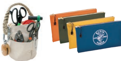
A small selection of wonderful functional bags

We have the best range of bags in town! Waterproof bags for the swim ashore, base camp expedition bags, ditty bags, tool rucksacks, small leather bags and the hugely popular coloured zipper bags to sort out all those bits and bobs.