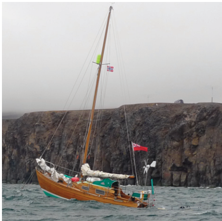
Sumara anchored in exposed waters off the Arctic Island Jan Mayen