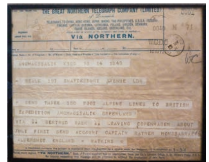
Telegram demanding Beale's rope be sent to Greenland on the next steamer.

The rope was world famous and was demanded for the early Everest Expeditions and by the British Arctic Survey. We still have the Llyods certification for the rope and the rather wonderful telegram below.