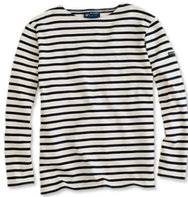
Saint James Shirt - the original fishermans top

Cheaper than buying online - support London's local chandler!