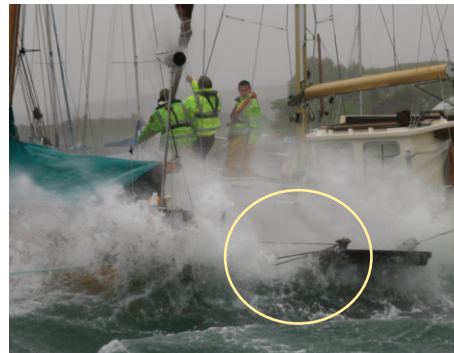
Our Classic Mooring Lines withstanding hurricane force winds at Dunstaffnage Scotland.

With the internet at hand you can often shop around and find items a few pounds cheaper but it may not be the best way to go. If you have a special project, maybe a Caribbean Circuit, trip to the Arctic, or the renovation of a classic yacht, then we would be happy to sit down with you and compile a tailored quotation. Not only may you be pleasantly surprised by the prices but we will endeavour to suggest products that are exactly suited to your needs. We hate products that don't withstand the rigours of the sea and one day you could be grateful you choose the best.