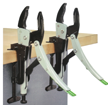
The Innovative Mobile Grip System