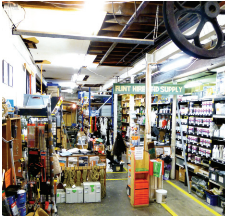
Flints Theatre Shop just off the Walworth Road