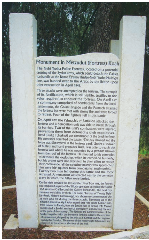
A MONUMENT at Nebi Yusha.