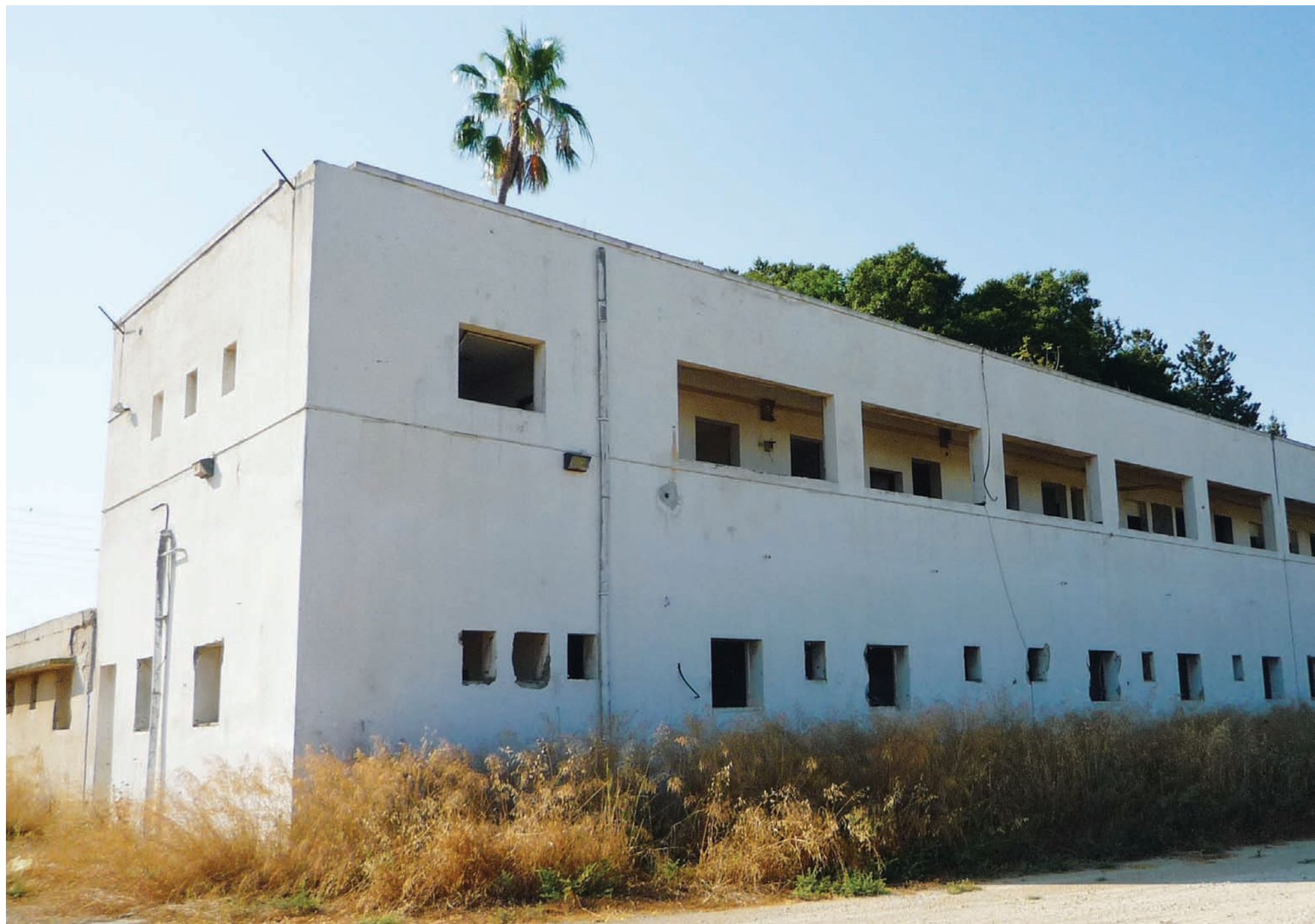
THE KATRA fort and a sign there (top right).