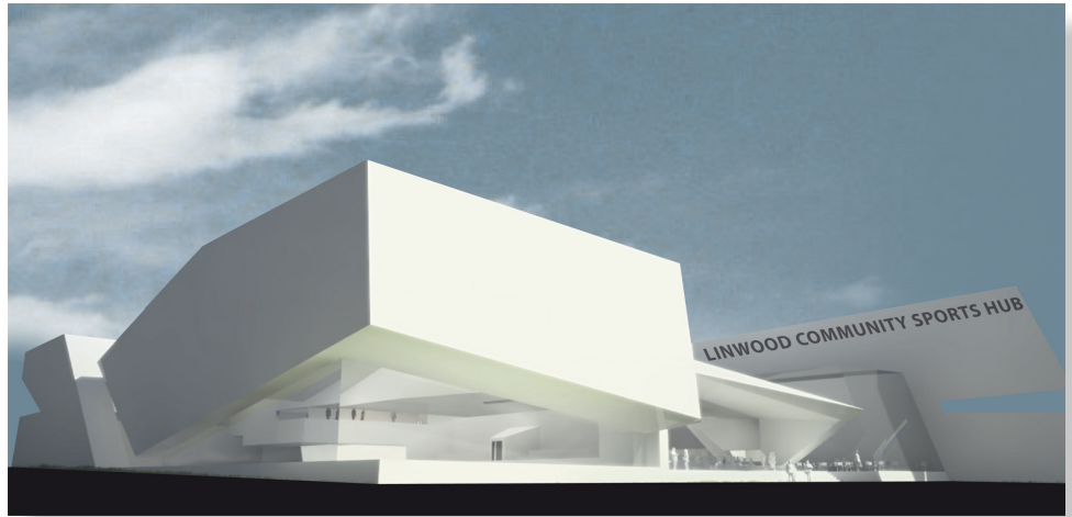
Linwood Community Sports Hub

BAM Construction Ltd is a £1 billion business operating from 12 Regional Offices in the UK including Glasgow and Edinburgh.