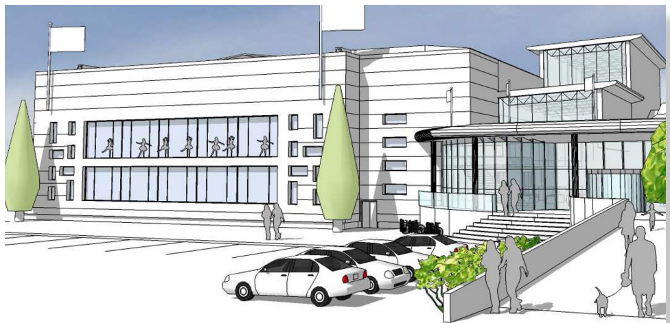
Paisley Lagoon Community Sports Hub