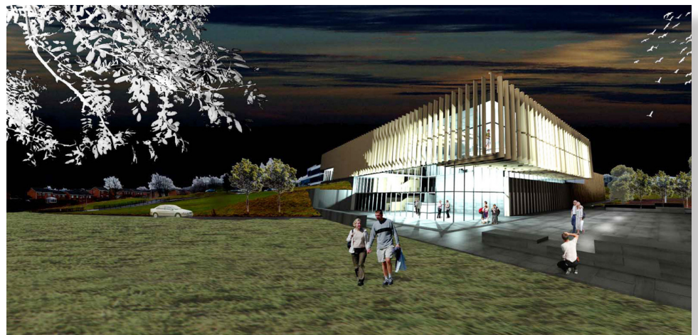
Johnstone Community Sports Hub