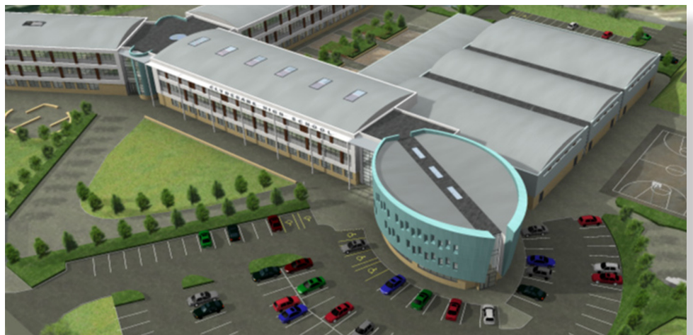
Park Mains High School, Erskine