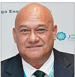
Lord Ma'afu.