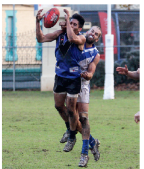
Unley Mercedes Jets are leading all-comers at present, with sides trying to work out how to beat them.

However, the Jets wouldn't want to assume ladder positions relate to how a side plays, with their weekend opposition Mitcham giving the Raggies a bit of fright last week.