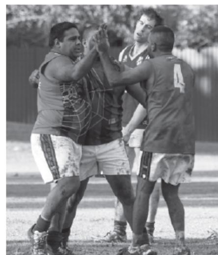
High fives all round for North Pines with the top five in sight.