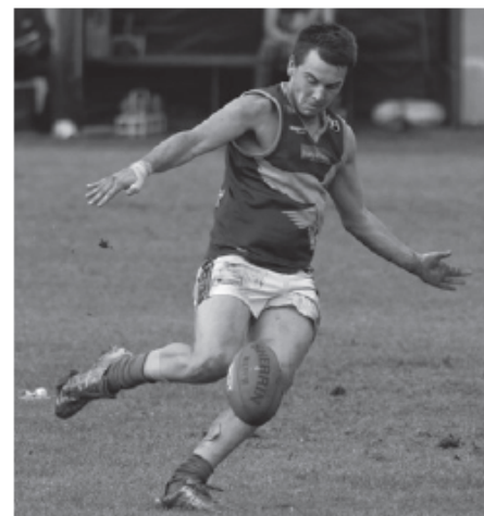
Elizabeth's confidence will be up after beating ladder leader North Haven.

Adelaide Lutheran and Greenacres can make it harder for the others to make the finals, with success when they come together this week.