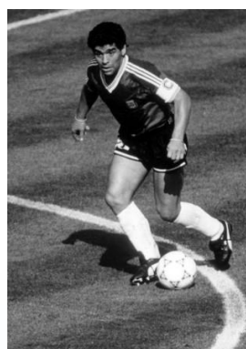
Diego Armando Maradona (ARG) as Captain at the 1990 FIFA World Cup Italy™