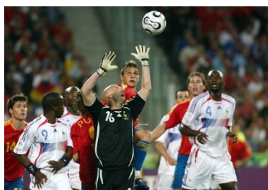
Italian goalie Walter Zenga in action during the 1990 FIFA World Cup match against Argentina ending in a win for Argentina after extra time. Goalkeeper Fabien Barthez (FRA) during the 2006 FIFA World Cup round of 16 match Spain - France 1:3.