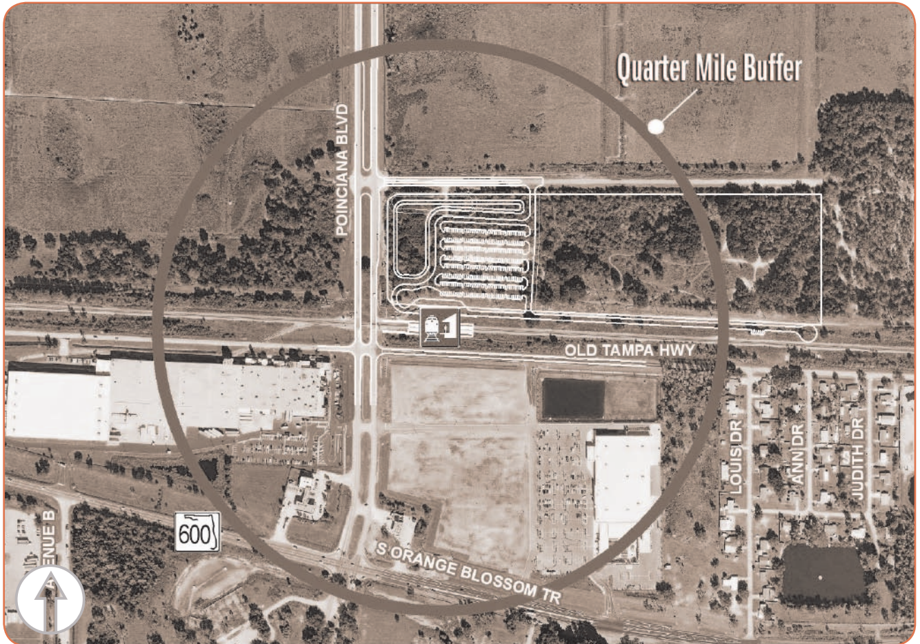
Aerial photo of existing conditions.

As a phase two station, Poinciana has the opportunity to get ahead of the curve with its land use and transportation planning to guide the development into a Neighborhood Center. The initial planning challenge will be to clarify the vision for the station area. The operative planning document for the area (Binding letter of vested rights or “BLIVER”) grants rights not consistent with the county TOD ordinance. The scale of underdeveloped land surrounding the station underscores the importance of creating a planning framework to guide phased implementation of the station area. In addition to the TOD Principles presented earlier in the report, next steps in TOD planning for Poinciana might include: