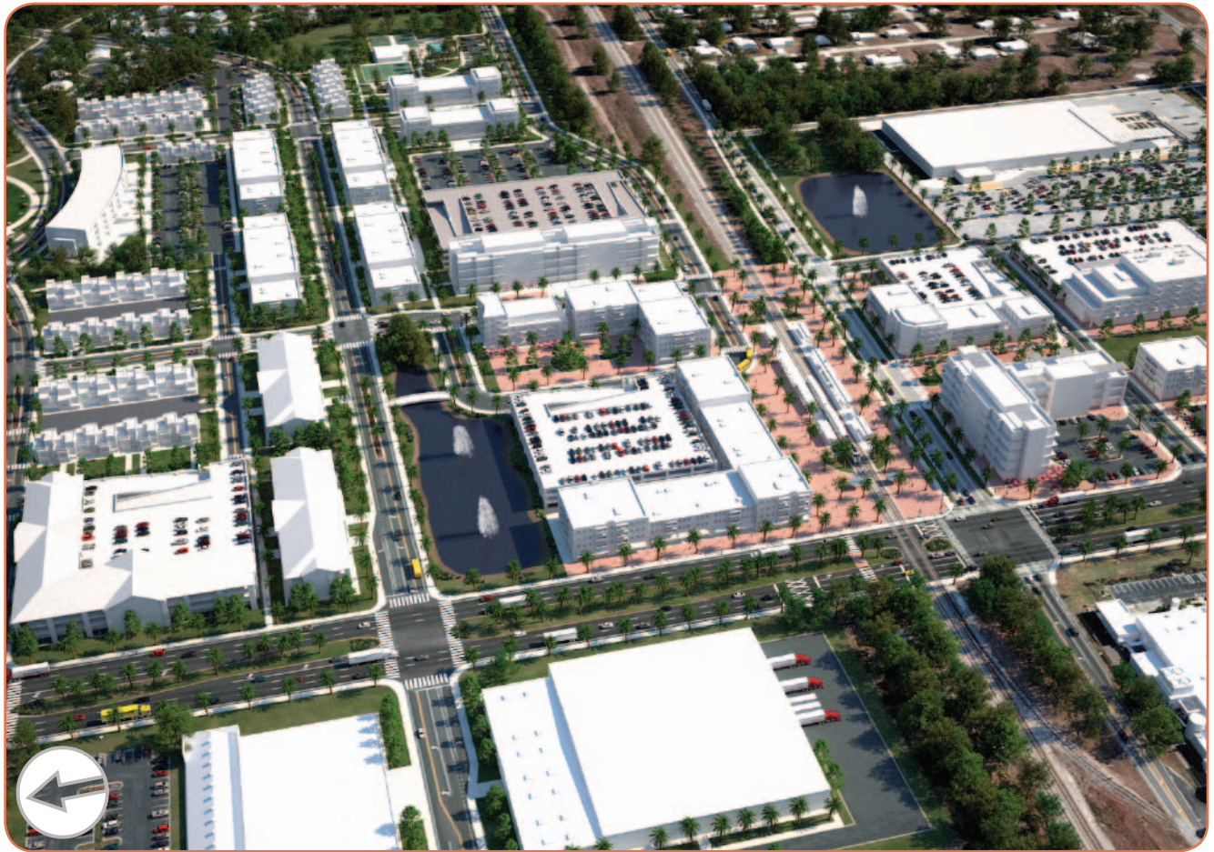
Artist's rendering looking southeast towards proposed station.