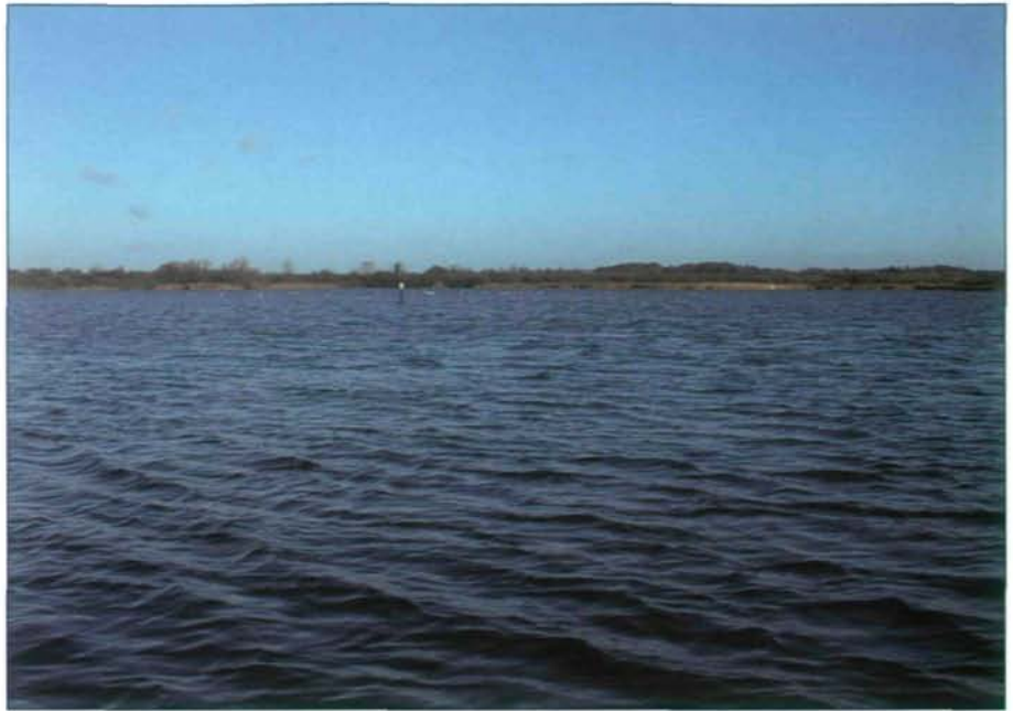
Fig. 6: Rockland Broad, Norfolk, U.K. – a site where Lophopus crystallinus was once abundant.

ALLMAN (1856) reports that L. crystallinus has been observed in a millpond near Little Baddow, Essex, a pond in the Zoological Gardens, Dublin, and “in the water by