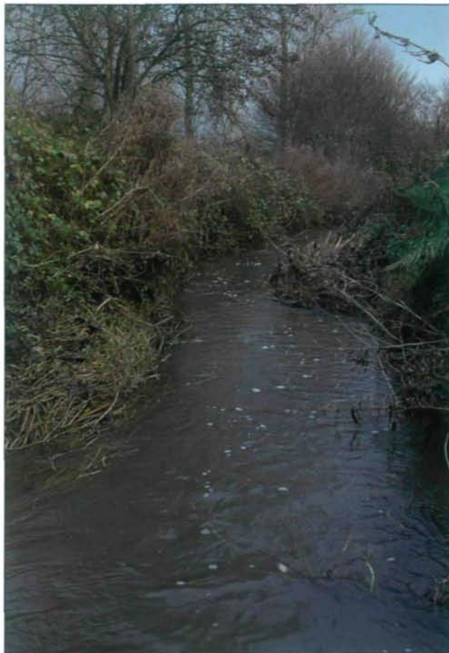
Fig. 8: The Chil Brook, Oxfordshire, U.K. – one of two sites in the U.K. where Lophopus crystallinus is currently found.

GRABOW et al. (2001) found L. crystallinus in 14 localities in eastern Lower Saxony.