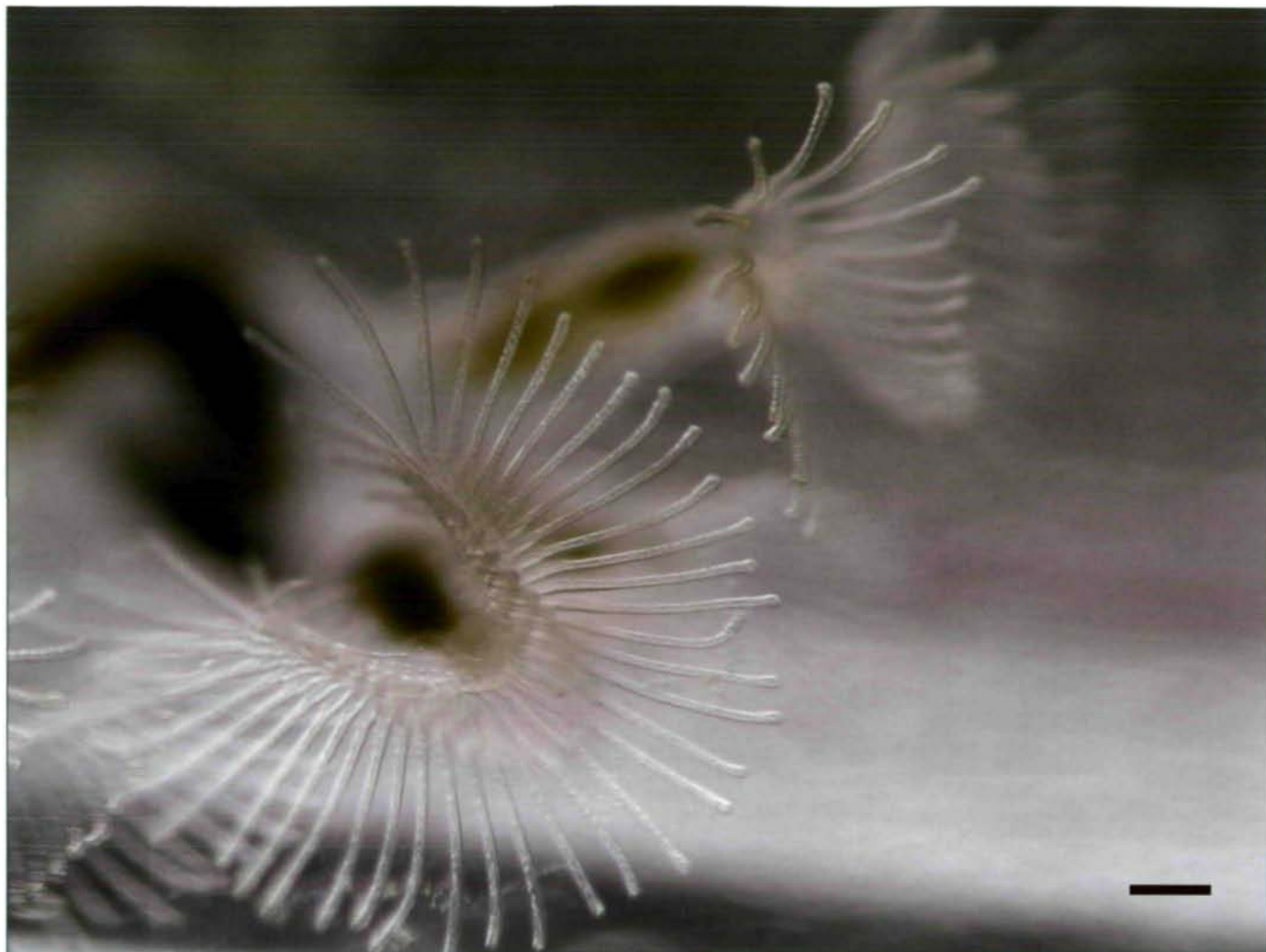
Fig. 4: Horseshoe-shaped lophophore of Lophopus crystallinus . Scale bar = 100 \mu m.