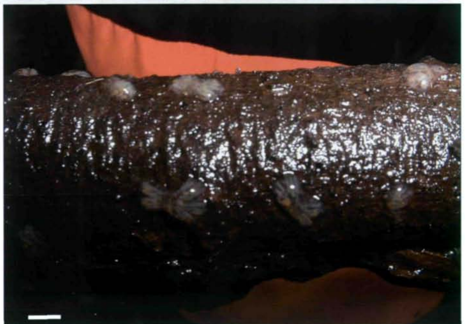
Fig. 3: Lophopus crystallinus growing on a branch in the Barton Blow Wells, Lincolnshire. Scale bar = 5 mm.

Lophopus crystallinus does not seem to have pronounced preferences for particular substrata. It has been found on the underside of various floating debris, including fallen leaves and sticks (Fig. 3), polystyrene, glass, and plastic (O'DEA 2002). It is also found on