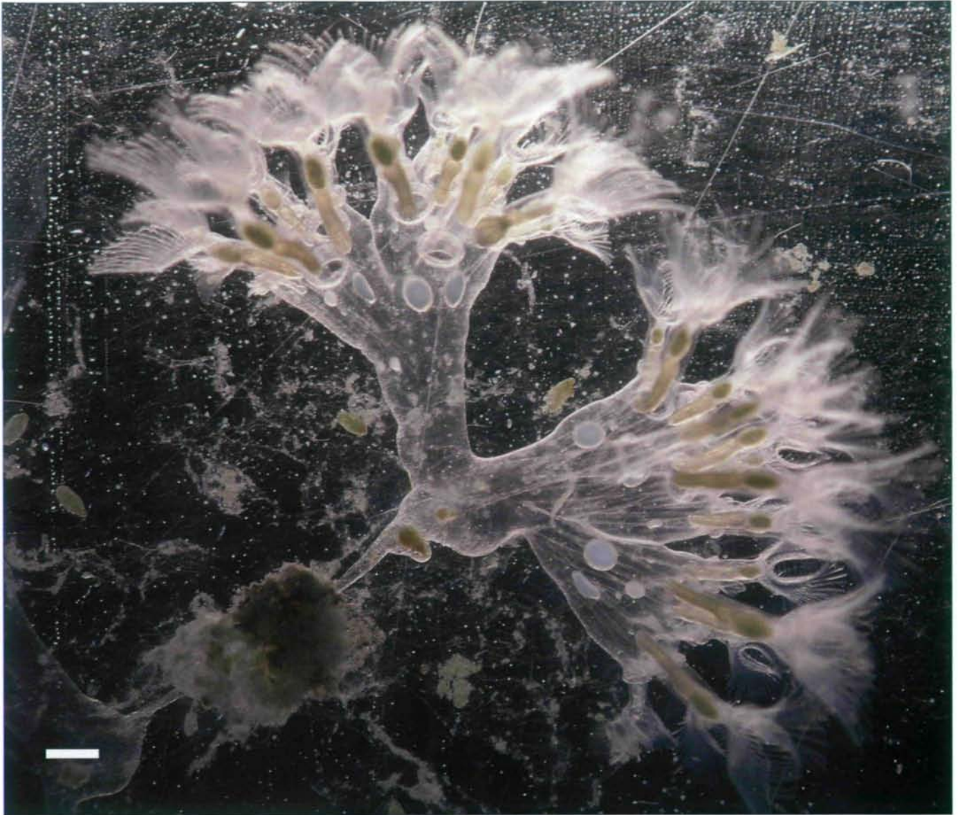
Fig. 2: Lophopus crystallinus . Colony was collected from Barton Blow Wells, Lincolnshire, and kept in a culture system at Reading University. Scale bar = 1 mm.

River Furtbach, Switzerland, in June (OKAMURA pers. obs.).