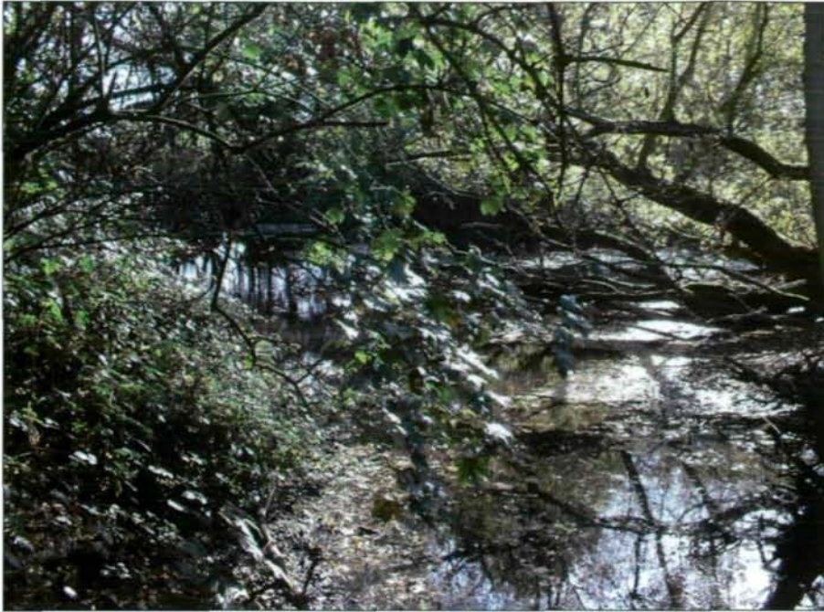
Fig. 7: Barton Blow Wells, Lincolnshire, U.K. – one of two sites in the U.K. where Lophopus crystallinus is currently found.

tions within the U.K. These represented the only U.K. sites with records for L. crystallinus within the last 30 years, and included the Wheatfen Broad where both MUNDY (1980) and HURRELL (1910) had previously reported the presence of L. crystallinus . He visited the sites every three months, from August 2001-May 2002. O'DEA used two methods for detecting the occurrence of colonies: 1) searching for live colonies on the undersides of possible substrata; 2) collecting bottom sediment samples and floating debris samples which were investigated for the presence of statoblasts.