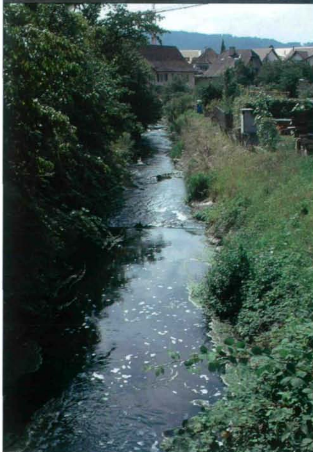
Fig. 9: The river Furtbach, Switzerland.