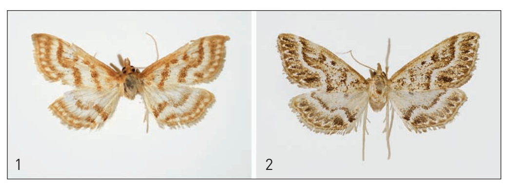
Figs 1–2. Adults of Anania . 1. A. ochrofascialis, holotype of Botys retowskyi Möschler from Ukraine, Crimea (ZMHB). 2. A. murcialis from Spain, Almeria (ZMUC).