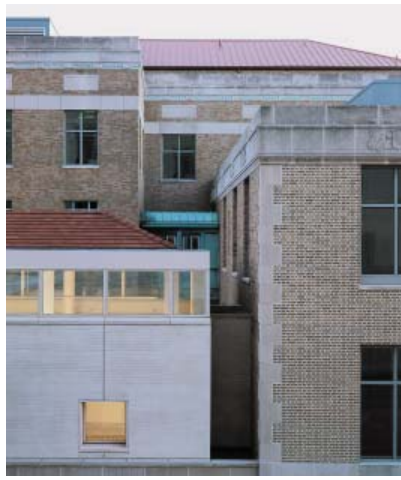
The Gallery is the culmination of the new public route via an added stair. Seen from the new courthouse, this small structure fits between the two wings and recalls the historic building materials.