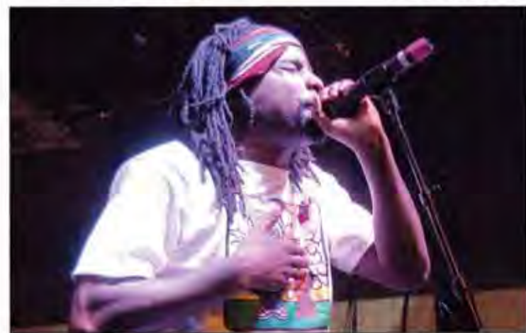
Hip-hop artist Wale performs during the Sunset Strip Music Festival.