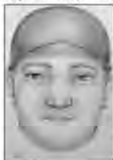
police sketch

The kidnapping occurred at approximately 4 p.m. as the