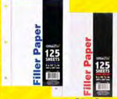
Filler Paper Wide or College Rule 125sheets