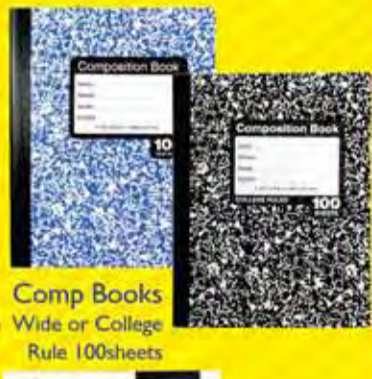
Comp Books Wide or College Rule 100sheets