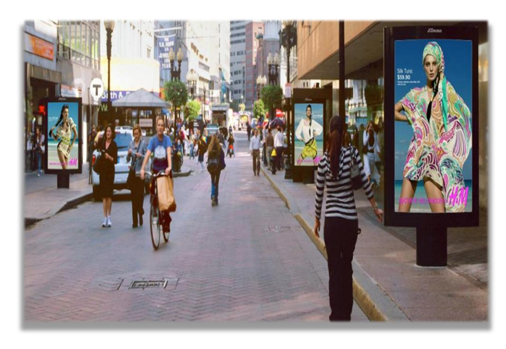
APPENDIX A Examples of advertising kiosks/displays