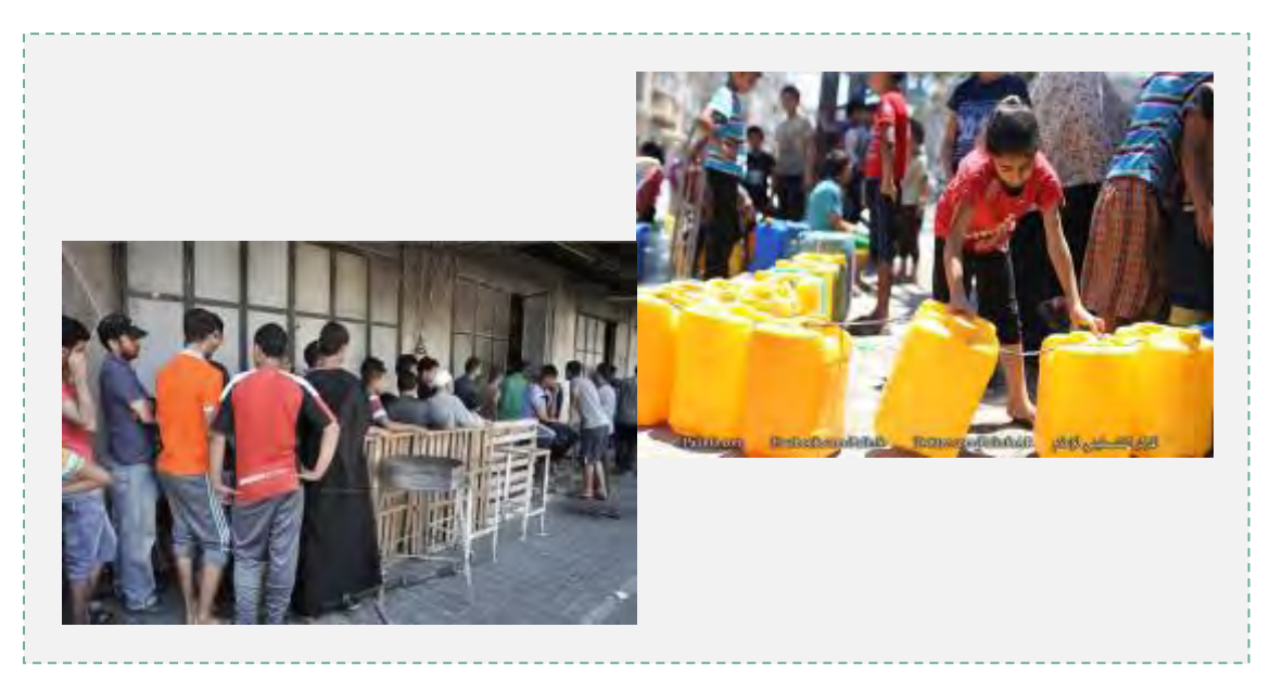
Left: The bread line (Paltoday.tv, August 3, 2014). Right: UNRWA distributes water to the residents of the Gaza Strip (Facebook page of Palinfo, August 3, 2014).