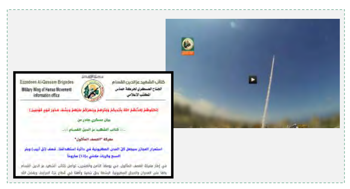
Left: The Izz al-Din al-Qassam Brigades' announcement. Right: A video of a rocket fired at Tel Aviv (Qassam.ps, August 3, 2014)

13. The Izz al-Din al-Qassam Brigades, Hamas' military-terrorist wing, issued an announcement claiming responsibility for rocket fire targeting Tel Aviv, Beersheba and the southern city of Kiryat Malachi. According to the announcement, the Izz al-Din al-Qassam Brigades still had a sufficient quantity of weapons to make Israel surrender to the Palestinians' demands (Qassam.ps, August 3, 2014).