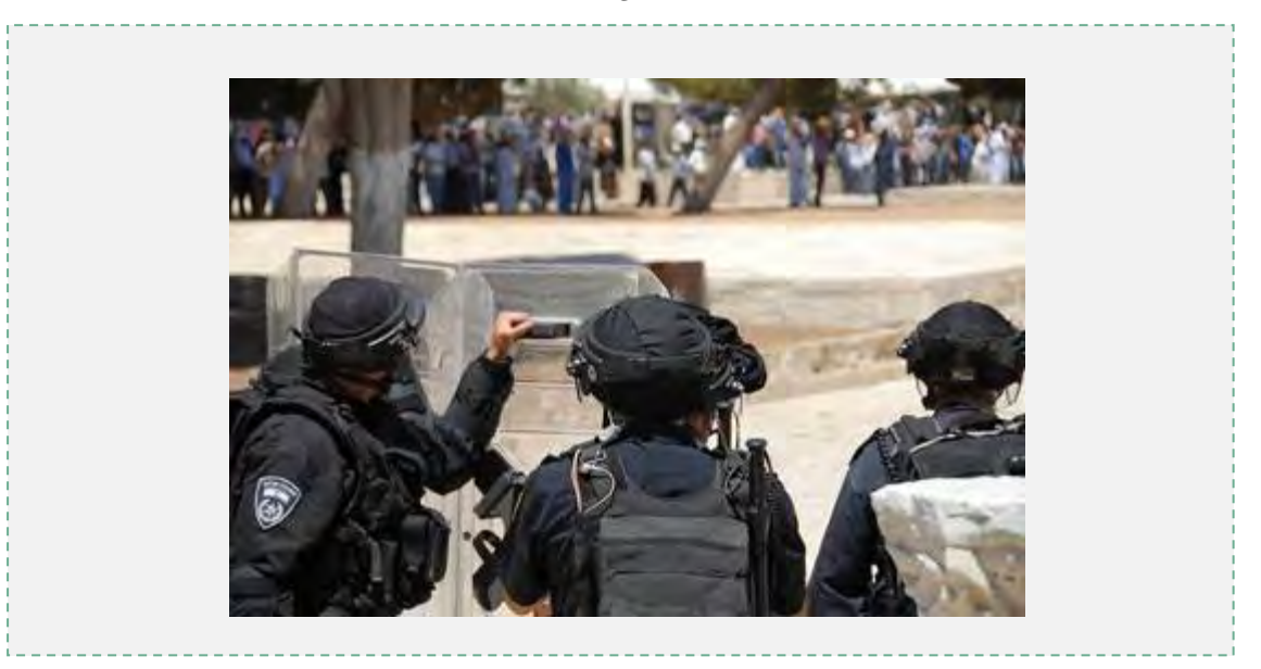
Confrontations between Palestinians and the Israeli security forces on the Temple Mount.