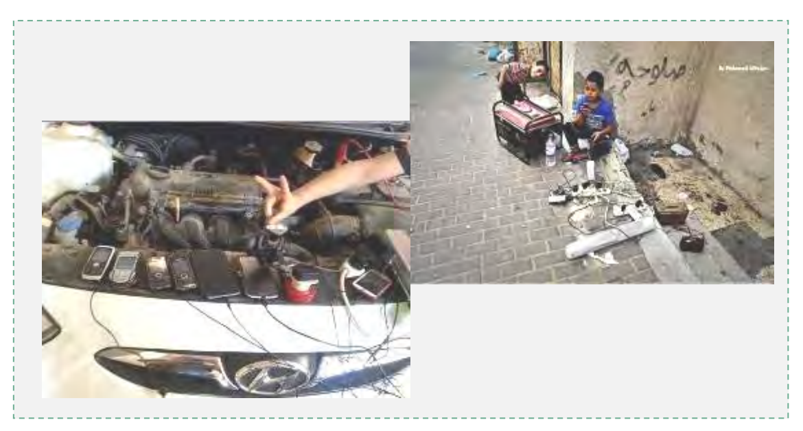
Creative ways to charge cell phones in the absence of electricity (Ghaza al-A'an, August 2, 2014).

21. According to an August 3, 2014 UNRWA report, 90 of its schools currently house 259,321 Gazans. The schools can house them for only a few days because they do not have appropriate sanitation facilities. In addition, UNRWA can occasionally supply three liters of drinking water per person daily, far less than the World Health Organization's standard of 9-15 liters a day (UNRWA.org, August 3, 2014).