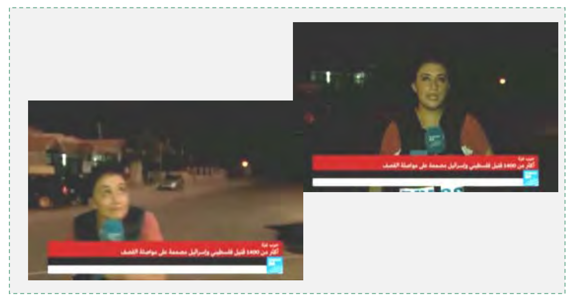
Left: The France 24 correspondent flinches away from the noise of the rocket launcher, and the flash can be seen. Right: The correspondent reporting from the Al-Shifa'a Hospital. Click https://www.youtube.com/watch?v=xuN6lzalalE for the video.

24. A France 24 TV broadcast in Arabic from Al-Shifa'a Hospital on the night of August 2, 2014, reported the difficult conditions prevailing in the hospital. While the correspondent was reporting, a rocket was launched close to where she was standing . The shriek of the rocket and the flash of its launch could be clearly heard and seen (YouTube, August 3, 2014).