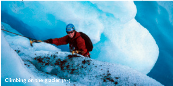
Climbing on the glacier (AF)