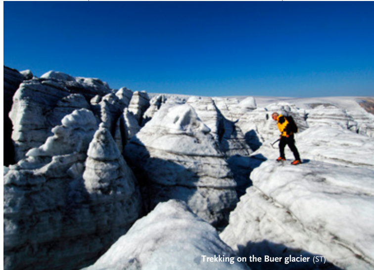
Trekking on the Buer glacier (ST)

Studies of superficial deposits dating from the last Ice Age and later show how glaciers have shaped the landscape. Many landforms in the area were moulded by the glaciers during the last Ice Age. Virtually the whole of Norway was covered by ice until 10 000 - 12 000 years ago. The highest peaks in the Rosendal 'Alps' seem to have been an exception, as their flat summits were shaped much earlier and remained insignificantly modified through the last Ice Age.