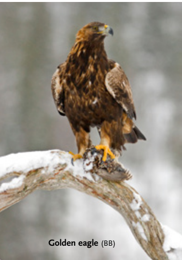
Golden eagle (BB)

Red deer are abundant in woodlands on the Folgefonn peninsula, and more are shot in Kvinnherad than anywhere else in the country. Black grouse are common near the tree line, and you may come across capercaillie a little lower down in the pinewoods. The natural woodlands in western Norway are one of the last refuges of the white-backed woodpecker in Western Europe. Avalanches have left numerous dead trees on the Folgefonn peninsula and such sites are particularly favoured by woodpeckers.