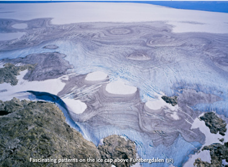
Fascinating patterns on the ice cap above Furebergdalen (JR)