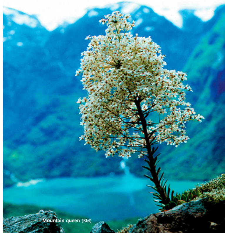
Mountain queen (BM)