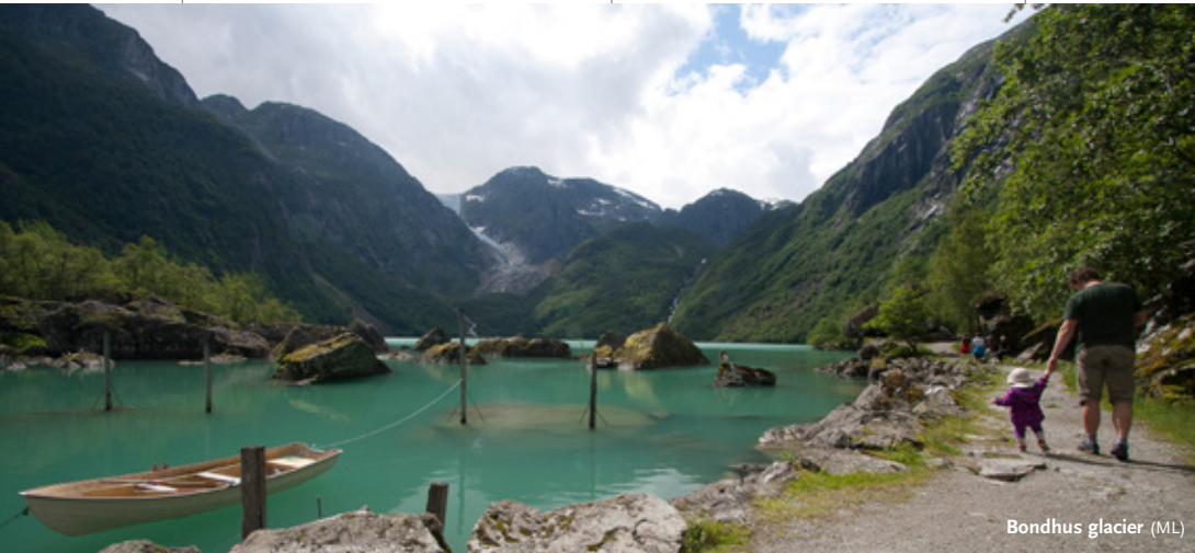
Bondhus glacier (ML)