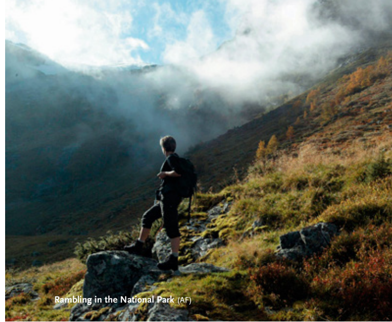
Rambling in the National Park (AF)

Precipitation is high on the west side of Folgefonna and down in the valleys, and you can find many plants there that thrive best in a moist climate. Even Wilson's filmy-fern, an extreme westerly plant, grows as far east as the Fureberg waterfall, because of the constantly wet local climate in the spray zone. Coastal plants like foxglove, bog asphodel, cross-leaved heather, hard-fern, lemon-scented fern and great wood-rush characterise the vegetation from the fjord up towards the tree line.