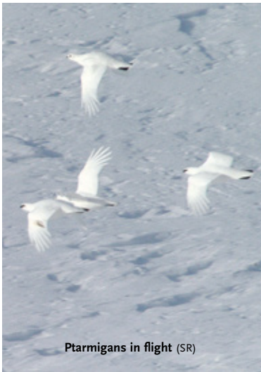
Ptarmigans in flight (SR)