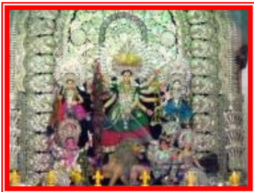
Cuttack Chandi Medha, Cuuttack

goddess, especially crowns but also many organizers are embellishing their pandals with their craft. The delicately woven silver and gold threads create a mesh of fine