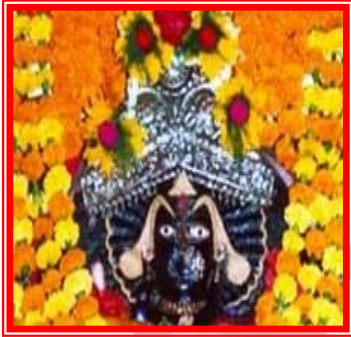
Maa Mangala, Kakatpur

the soothing smell of flowers. The pilgrims throng the city all the year round making a more lively and spiritual environment. According to Markandeya Purana the King of Chedi dynasty Suratha started rituals of Durga Puja during 300B.C. Durga Puja has different names in different Puranas and Sastras. In Devi Purana & Kalika Purana it is named as Vijaya Dashami. It is named as Mahaparvana in Devi Mahatmya and Dussehra in Markandeya Purana. Durga Puja is one of the most important festivals in Orissa. Here Durga Puja is more than a festival. It is a celebration of life, culture, popular customs and traditions. It is a time of reunion and rejuvenation to love, to