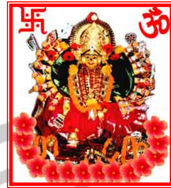
Cuttack Chandi, Cuttack

She is the mother of world. A small ray of her kindness is enough to remove all the sorrows and obstacles. She is the mother who is always there to remove all the worry of the people of world. Those who worship her really never face any problem in their life, because the loving mother removes their problems by her smiles. Again at one time she is Maha Laxmi (The Goddess of