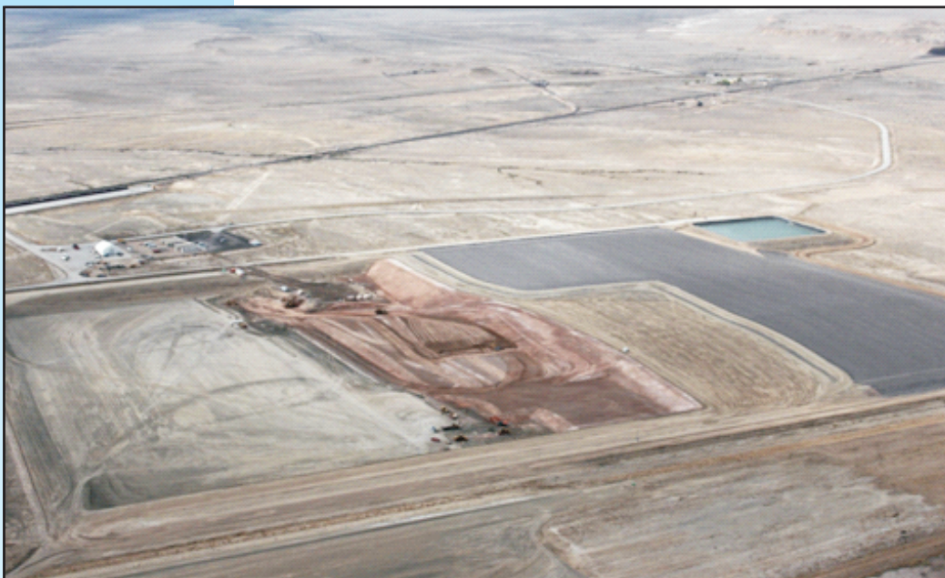
Crescent Junction disposal cell

At the Crescent Junction site, the containers carrying tailings are unloaded from the train onto trucks that take them to the disposal cell dumping area. The tailings are dumped through end gates in the containers and placed in the cell in 1-foot lifts to meet compaction specifications. The empty containers are reloaded onto railcars and returned to the Moab site.