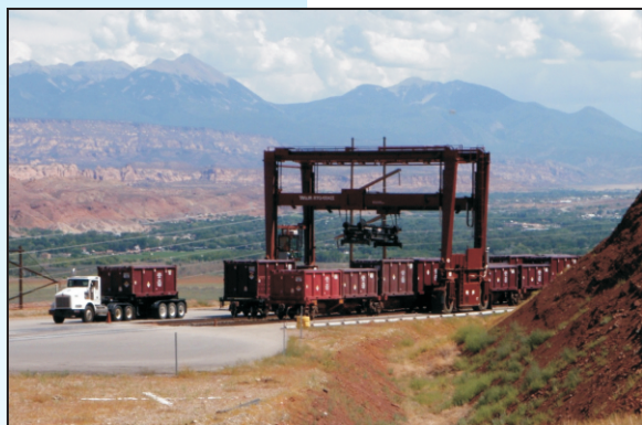
A gantry crane transfers containers to and from the train

DOE utilized previous investigations along with additional soil and ground water sampling to assess the extent of contamination at the Moab site. Elevated concentrations of ammonia can affect young-of-year endangered fish species in backwater channels adjacent to the Colorado River bank. In 2003, DOE began implementation of an interim action system that currently includes 8 extraction and more than 30 freshwater injection wells. The system is designed to protect surface water quality and to recover ammonia, uranium, and other contaminants prior to discharge to the Colorado River.