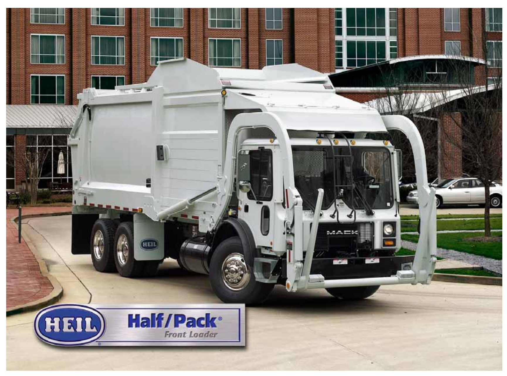
PAGE 4 OF 5 PAGES AGENDA ITEM NO. 6.C