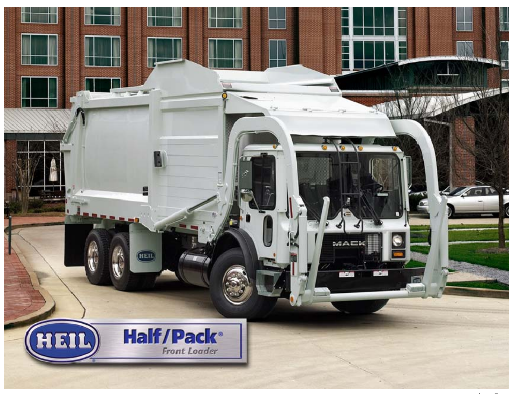
PAGE 4 OF 5 PAGES AGENDA ITEM NO. 6.B