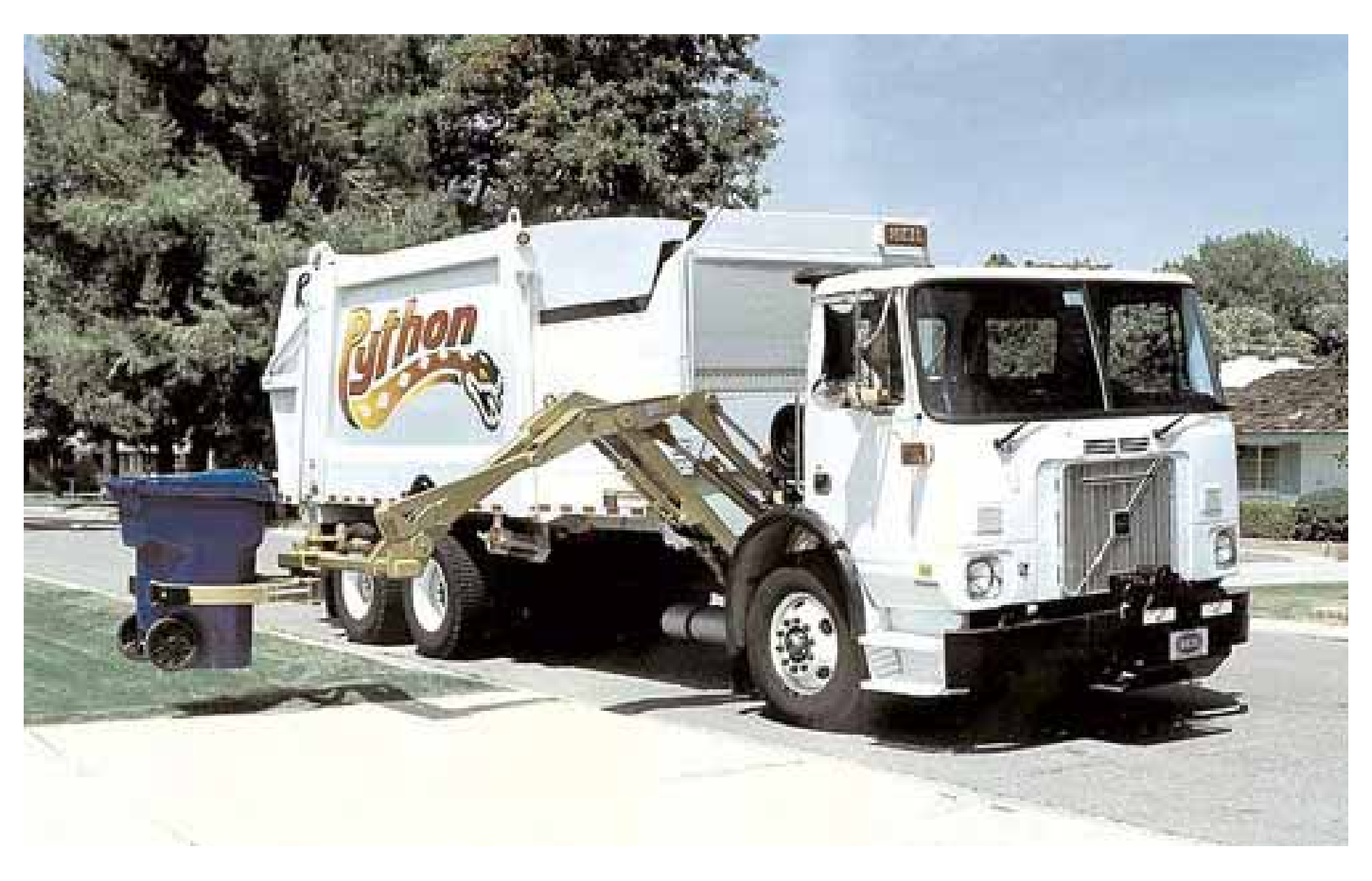
PAGE 3 OF 5 PAGES AGENDA ITEM NO. 6.C