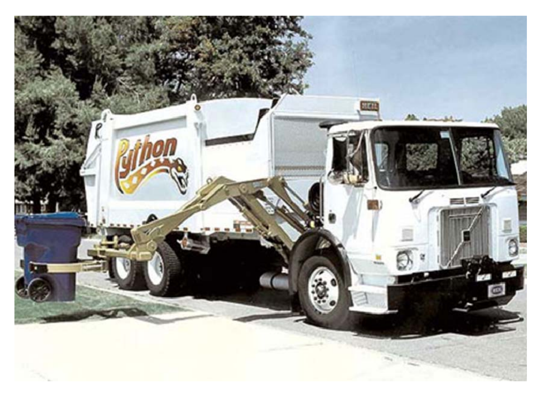
PAGE 3 OF 5 PAGES AGENDA ITEM NO. 6.B