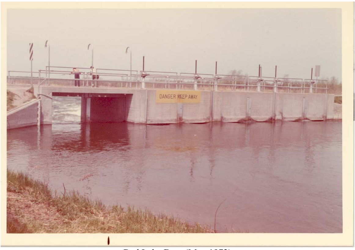
Red Lake Dam (May 1972)

Upper and Lower Red Lakes have only one outlet, the Red Lake River. The water release capacity of the control structure is very small in relationship to the size of the drainage area; control efforts to release high water can take years. The current outflow capacity, which averages approximately 1,000 cfs over the four seasons (maximum capacity of 1,200 cfs), can drop lake levels only 0.2 foot per month, assuming no inflow is occurring. In contrast, normal evaporation during the summer may be equivalent to 2,000 cfs and can drop the lake level 0.4 foot per month. Furthermore, the full outflow capacity is usually not available during high water conditions because of the governing outflow restraints imposed by the downstream farming interests in accordance with project criteria. Inflow generally is also quite high in wet years.