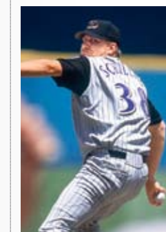
2001 CURT SCHILLING