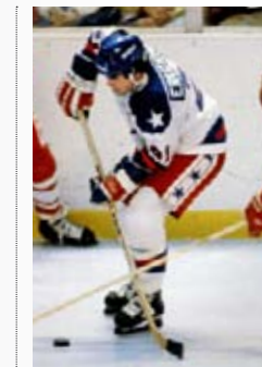
1980 MIKE ERUZIONE, U.S. HOCKEY TEAM