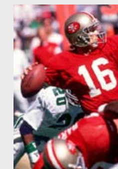
1990 JOE MONTANA