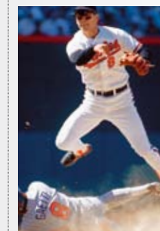
1995 CAL RIPKEN