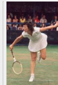
1972 BILLIE JEAN KING