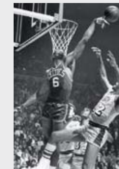
1968 BILL RUSSELL