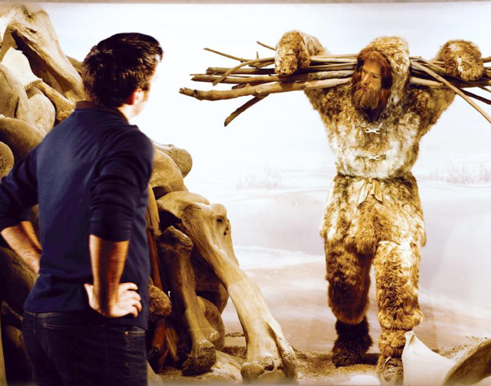
DIORAMA OF A Stone Age man as he might have lived some 15,000 years ago was photographed at the Hall of Human Origins at the American Museum of Natural History in New York City.